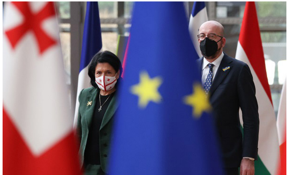
The President of Georgia Salome Zourabichvili and the President of the European Council Charles Michel.

According to her, today a window of opportunity is being opened where Europeans are ready to look at the future of Ukraine, Georgia, and Moldova differently. She noted that the whole of Europe is united today and Georgia must