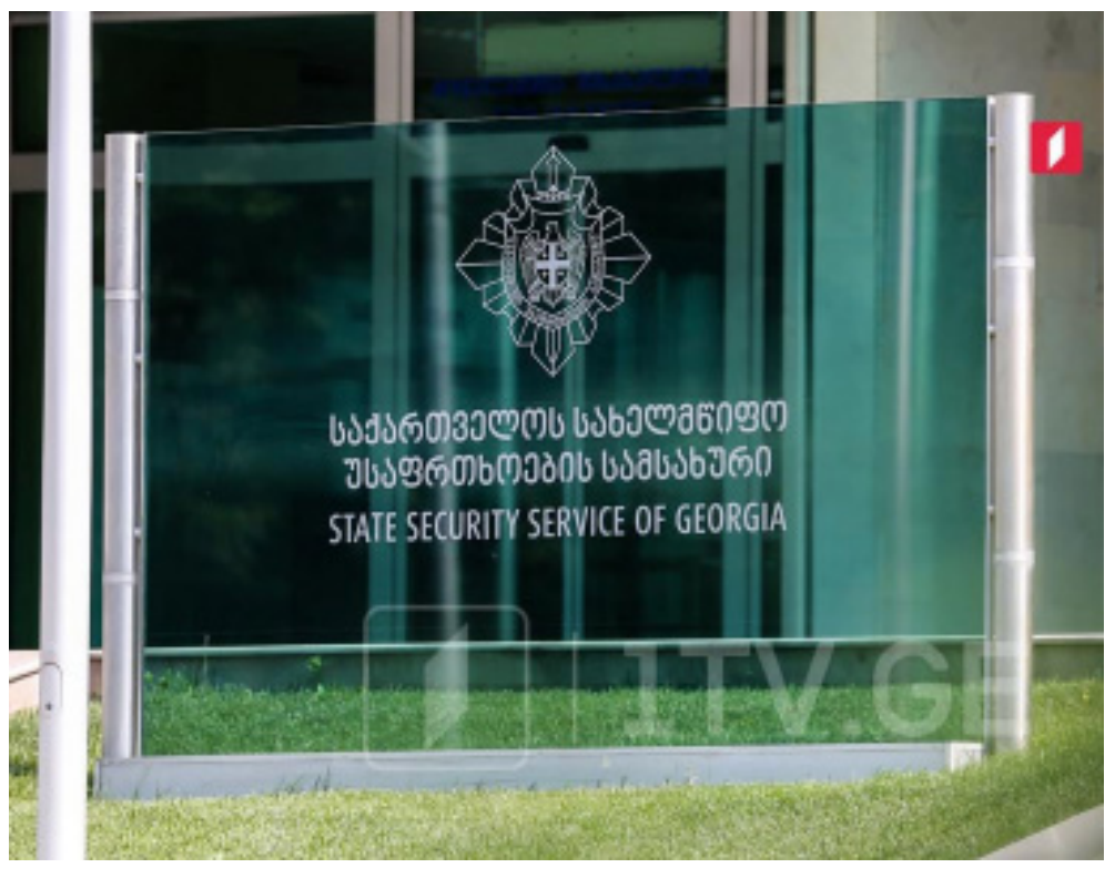
The economy minister stressed that Georgian law enforcement agencies remain 'vigilant' so that sanctioned people do not enter the country and that their businesses are traceable.

According to the SSS, "as a result of the measures taken, a calm and safe en-