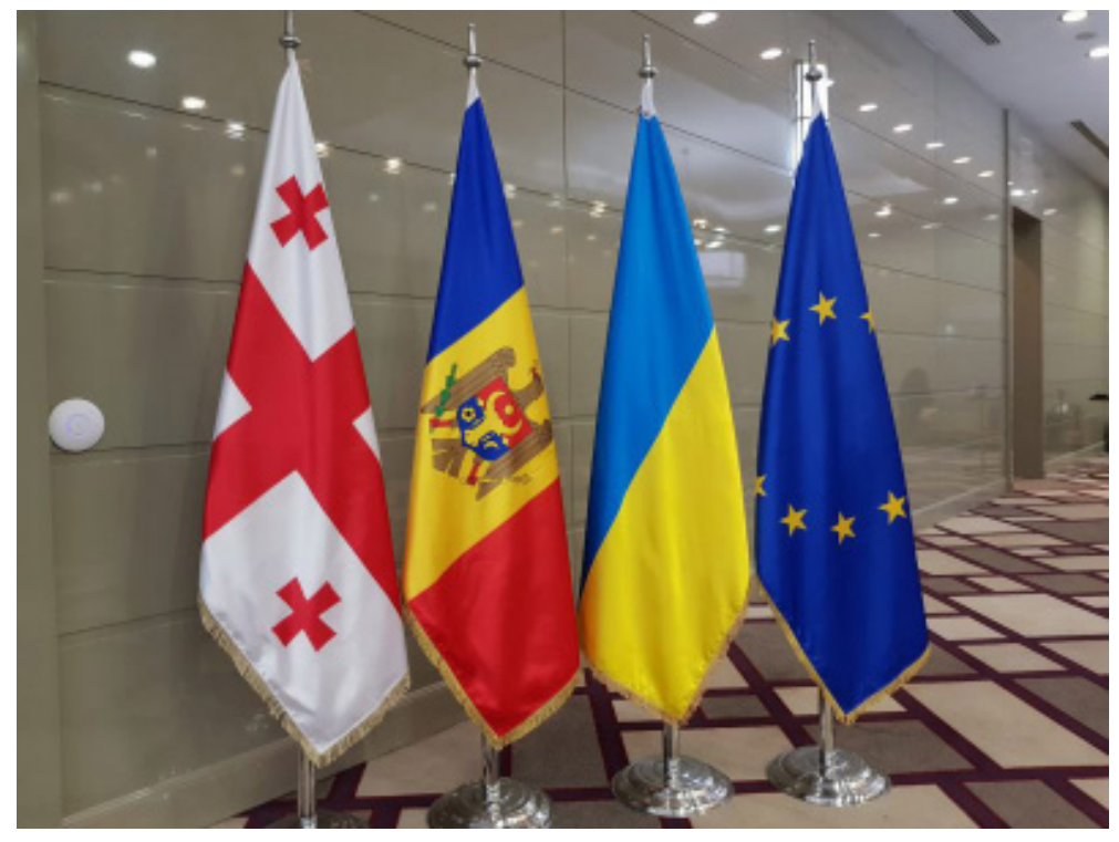
Georgia and Moldova submitted formal applications for EU membership on March 3.