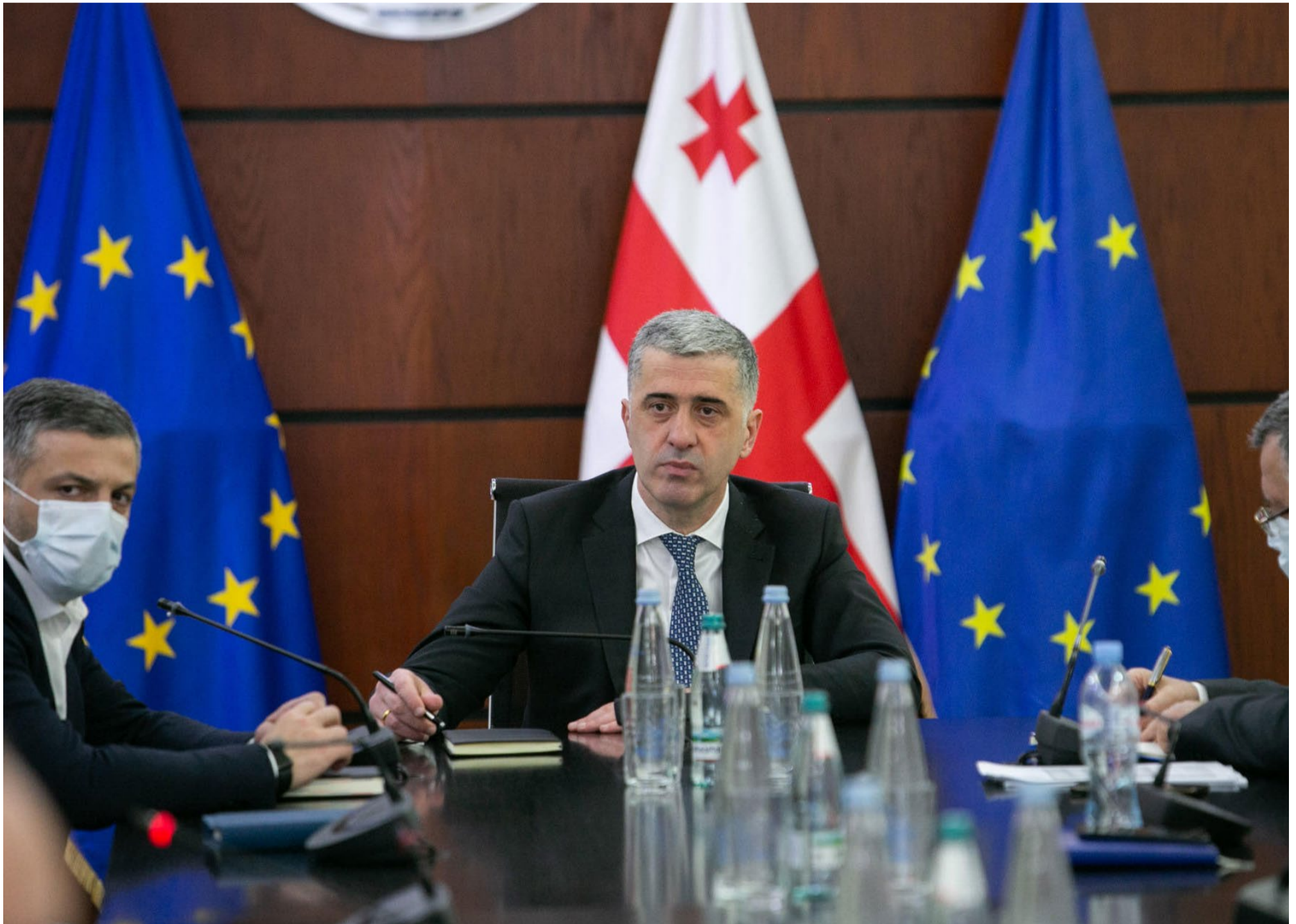
► "I declare with full responsibility that there is no shortage of supplies," said Otar Shamugia, Georgian Minister of Environment Protection and Agriculture.