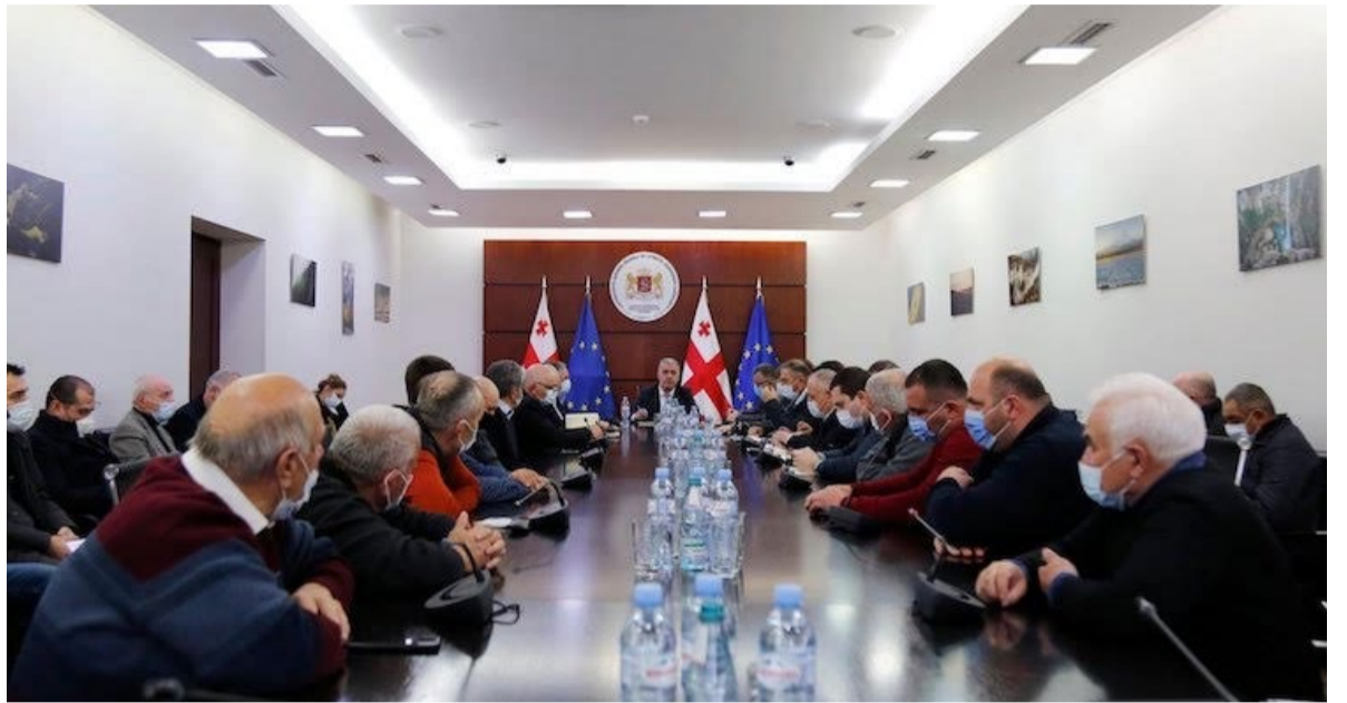
► As decided at the meeting with farmers, the relevant structures of the Agriculture ministry will start working on developing proposals and support mechanisms to tackle issues in the sector.