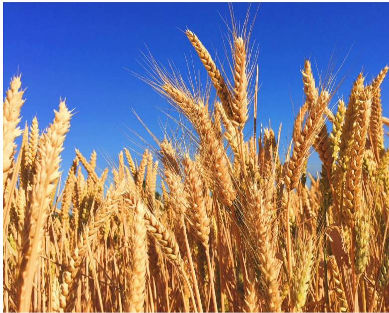
► In 2021, Georgia exported 338,000 tons of wheat worth $87.4 million from Russia.