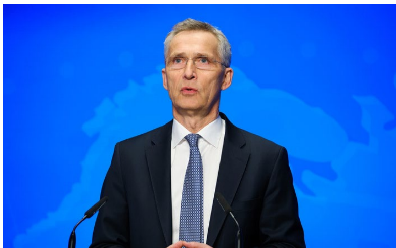
► "Georgia is a partner which is important for NATO", NATO Secretary-General Jens Stoltenberg said.