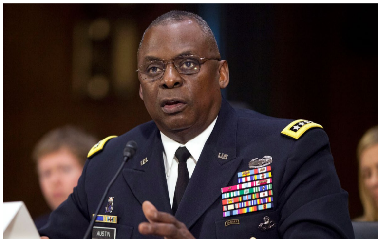
► US Secretary of Defense Lloyd Austin announced that the United States is considering ways to provide additional assistance to Georgia.