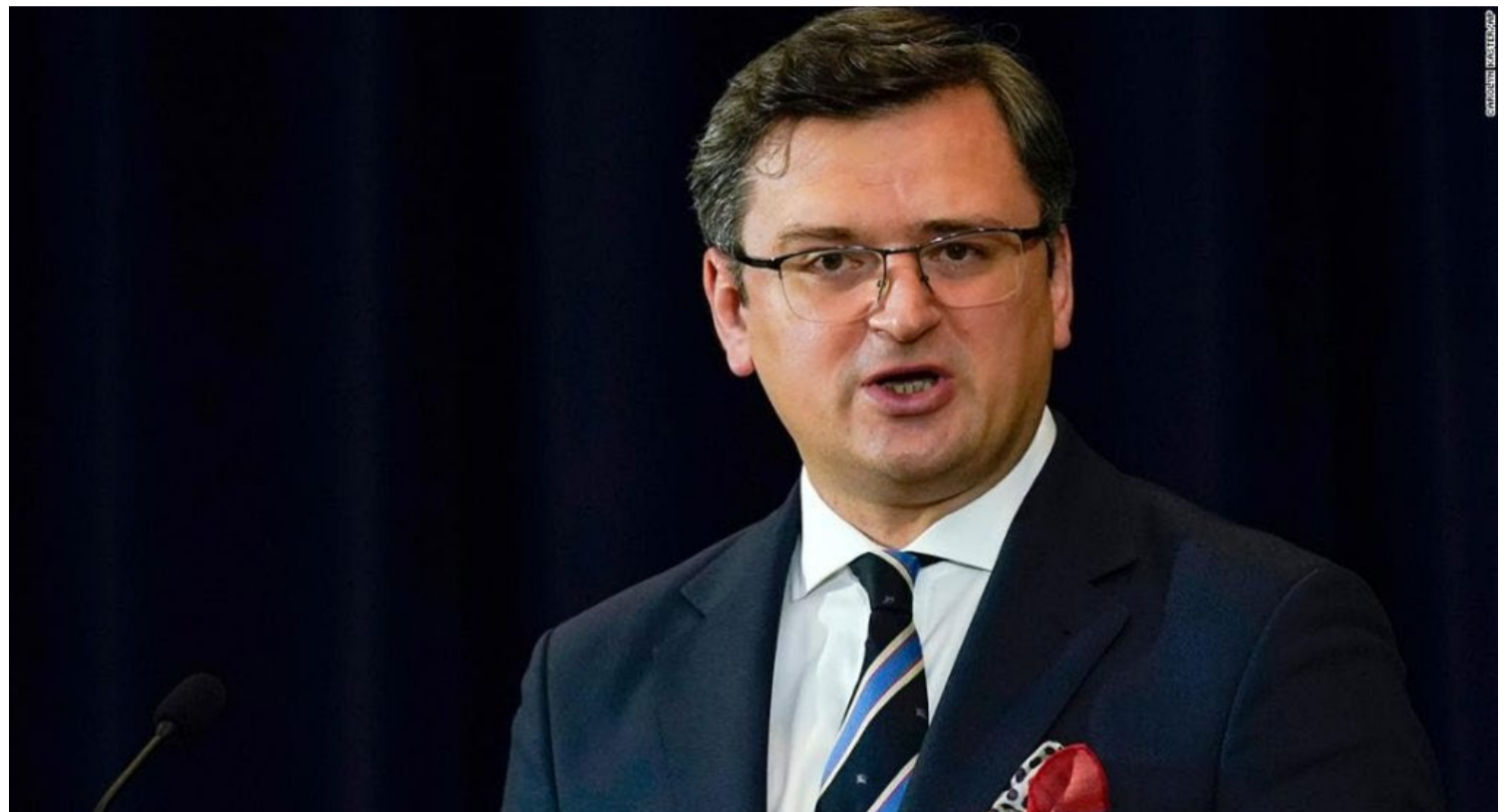
► According to the intelligence department of the Ministry of Defense of Ukraine, Russia is developing smuggling channels through Georgia.

According to him the meeting underlined the destructive nature of such accusations and statements and noted that it unequivocally damages the relations