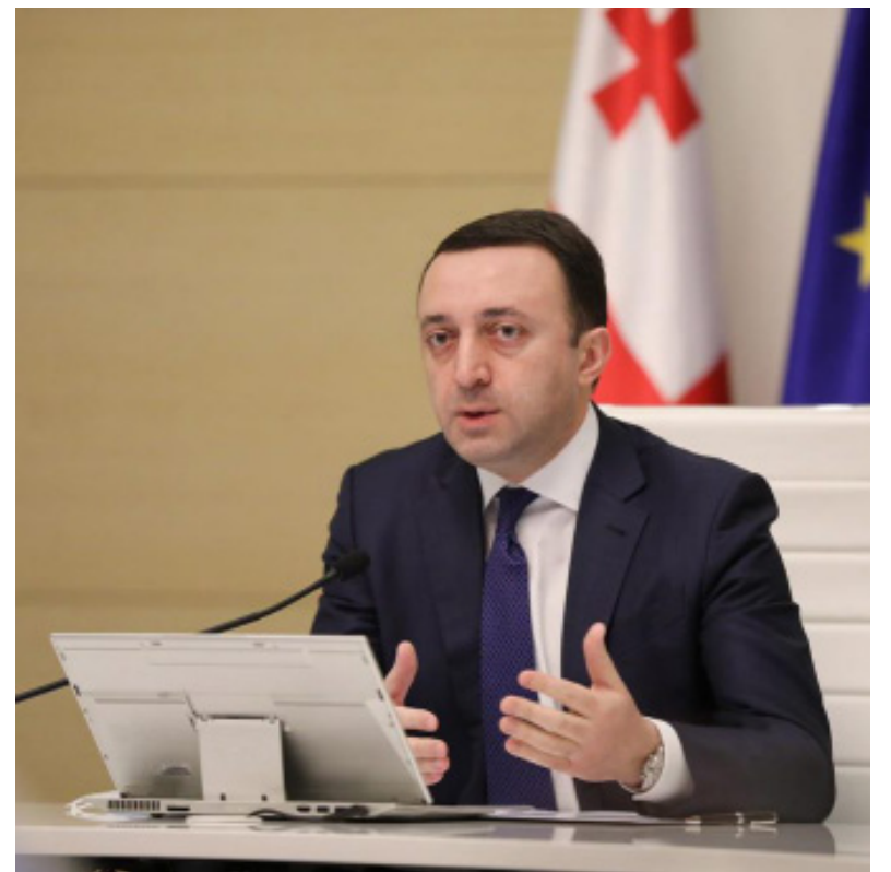
According to the PM of Georgia, Irakli Garibashvili, price reduction on medication has been witnessed as Georgia gained exposure to the Turkish market.