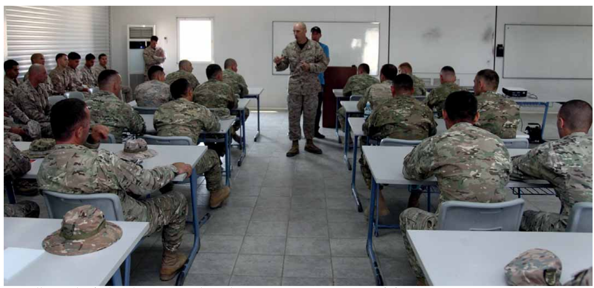
Georgian soldiers receive classes from the United States Marine Corps in the National Training Center "Krtsanisi".