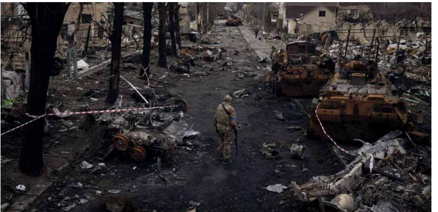
A Ukrainian serviceman walks amid destroyed Russian tanks in Bucha, on the outskirts of Kyiv, Ukraine.

For Russian soldiers, this is simply a means to an end. Civilians are either an obstacle to overcome or a bargaining chip on the battlefield. As seen in Ukraine, they have seemingly attempted to use their deaths as a psychological weapon against Ukrainian defenders. Additionally, they are a virtual hostage to pressure Kyiv to sue for peace on Russian terms. While the full scope of the devastation has yet to be fully calculated, it is likely the full civilian toll has yet to be taken.