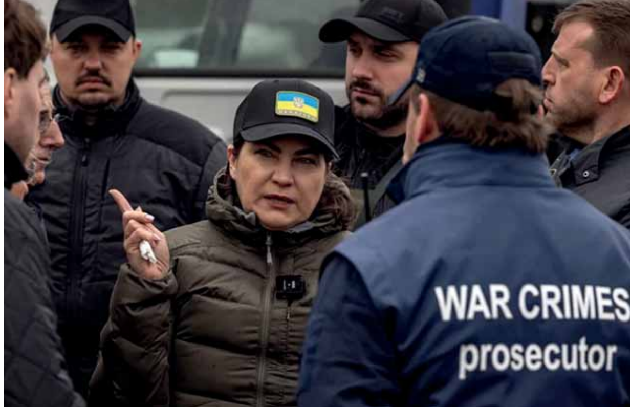
Ukraine's Prosecutor General Iryna Venediktova visits a mass grave in Bucha, on the outskirts of Kyiv, on April 13, 2022.

For Russian soldiers, this is simply a means to an end. Civilians are either an obstacle to overcome or a bargaining chip on the battlefield