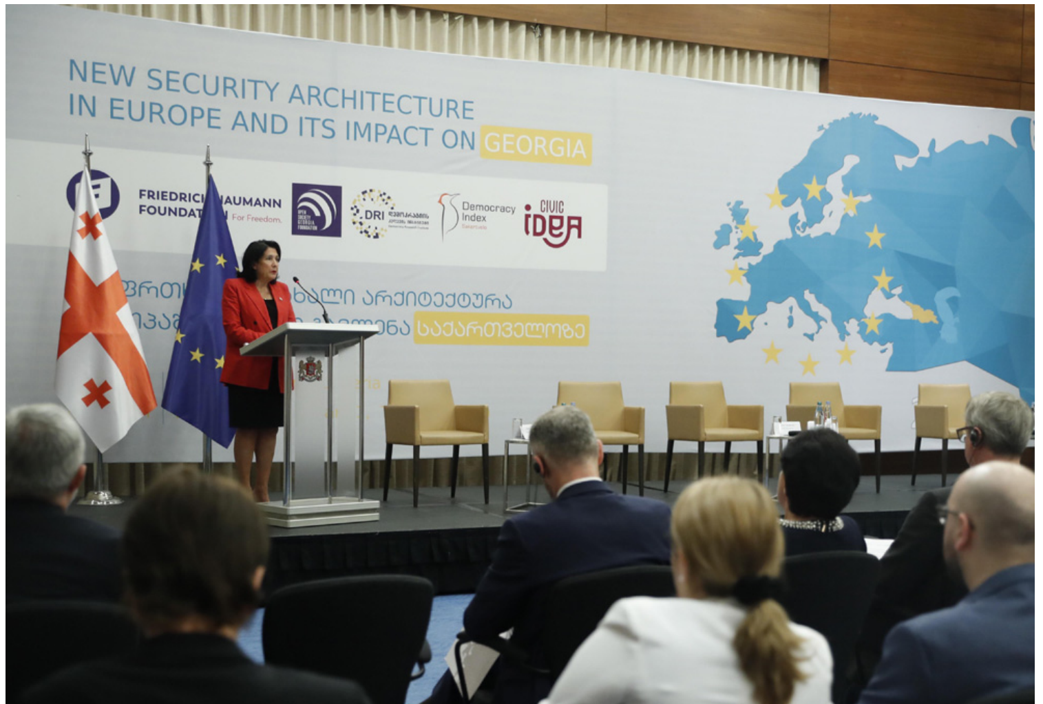
Georgian President Salome Zourabichvili at the conference "New security architecture in Europe and its impact on Georgia".

If it uses somehow mixed criteria, how will it balance the need for expansion and the need for economic or social enhancement? Against the background of this