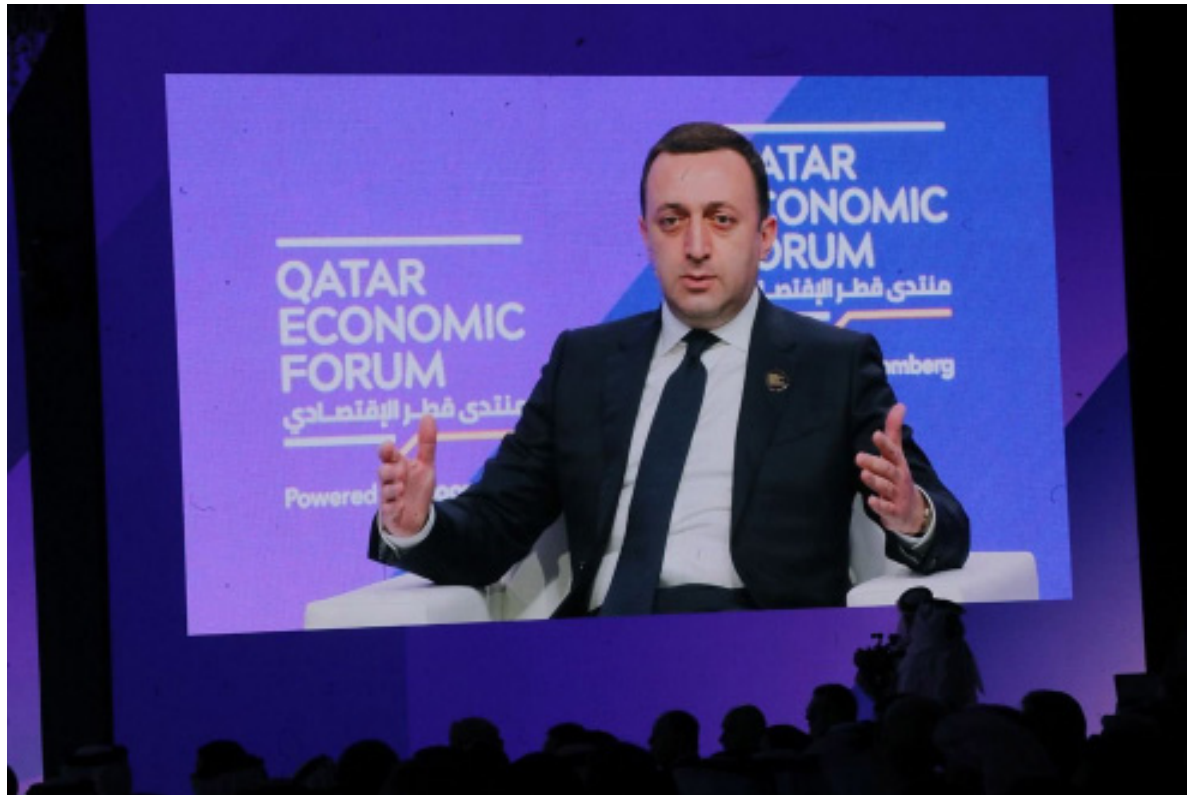
According to Georgian Prime Minister Irakli Garibashvili, Georgia first needs to resolve its territorial problems to become a member of NATO.

At the Qatar Forum, the PM also stressed that Georgia fought against Russia three times over the last 30 years and the Georgian government's policy is to restore territorial integrity and sovereignty through peaceful