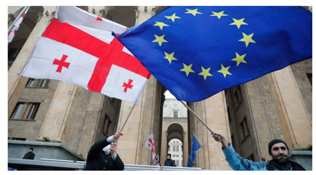
lacktriangle "We believe they [Georgian people] too should be offered an equally concrete roadmap to EU membership",