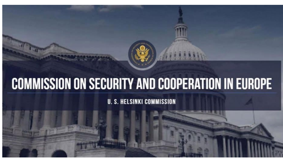
▶ The Helsinki Commission is a United States Government agency monitoring security in Europe.