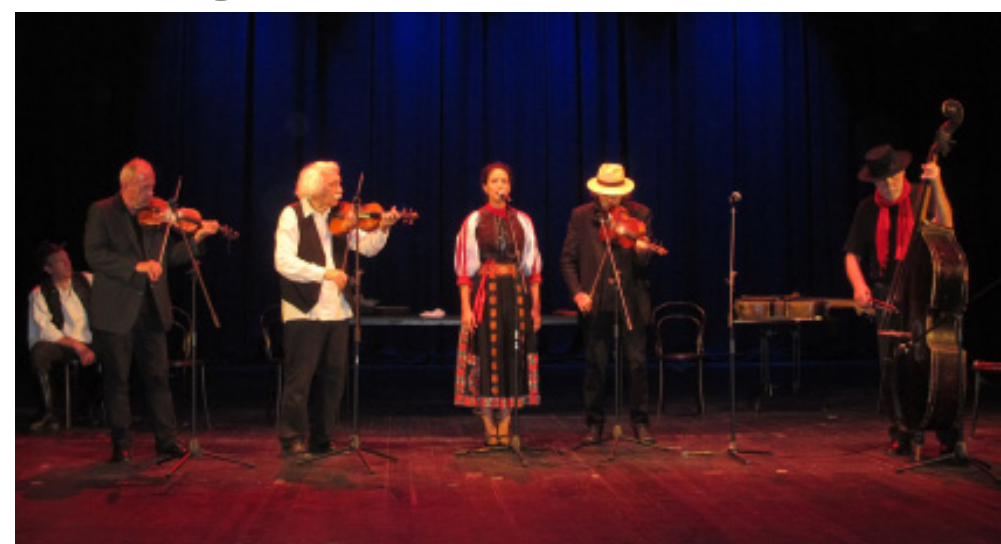
Folk musical ensemble 'Muzsikas'