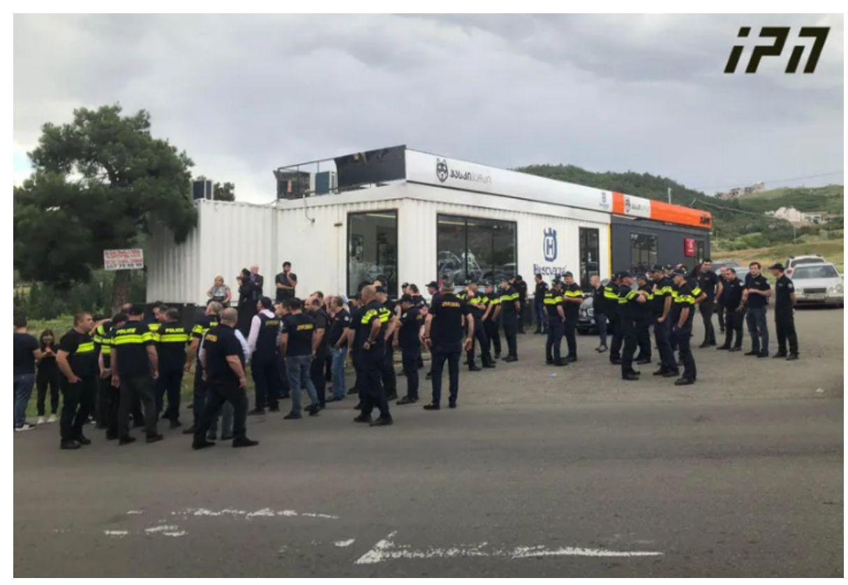
The rally participants claimed that they did not trust the Tbilisi Pride organizers, who pledged not to hold a parade at the central avenue, and gathered to 'protect the territory'.