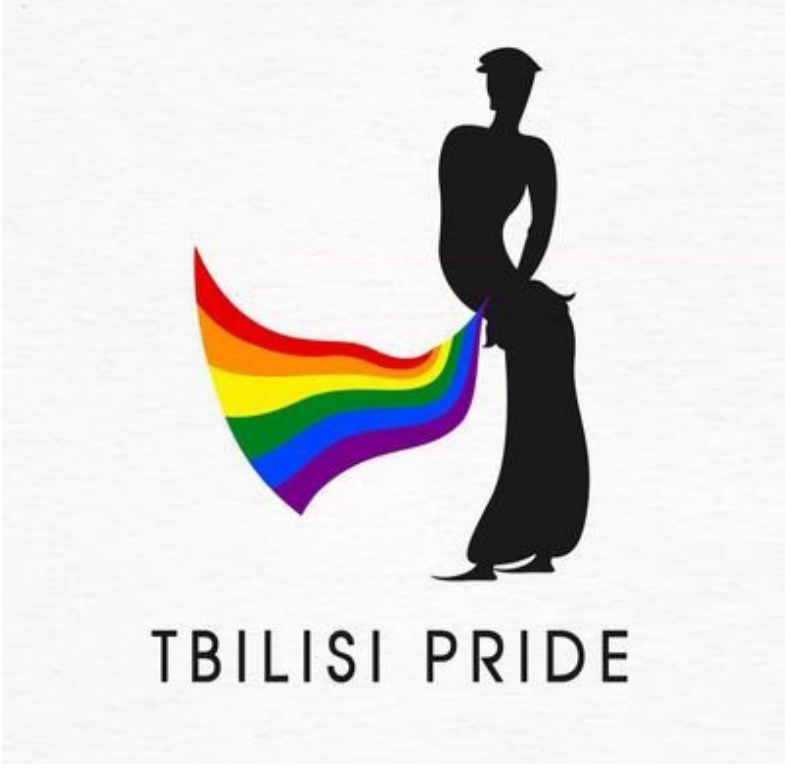
This year, LGBT+ rights group Tbilisi Pride was organized without a public March for Dignity due to safety concerns.

On Saturday an incident took place near the parliament building as one of the protesters tried to burn himself. However, the police diffused the tension and the injured person was taken to a hospital. The rally participants also burned Tbilisi Pride and European Union flags.