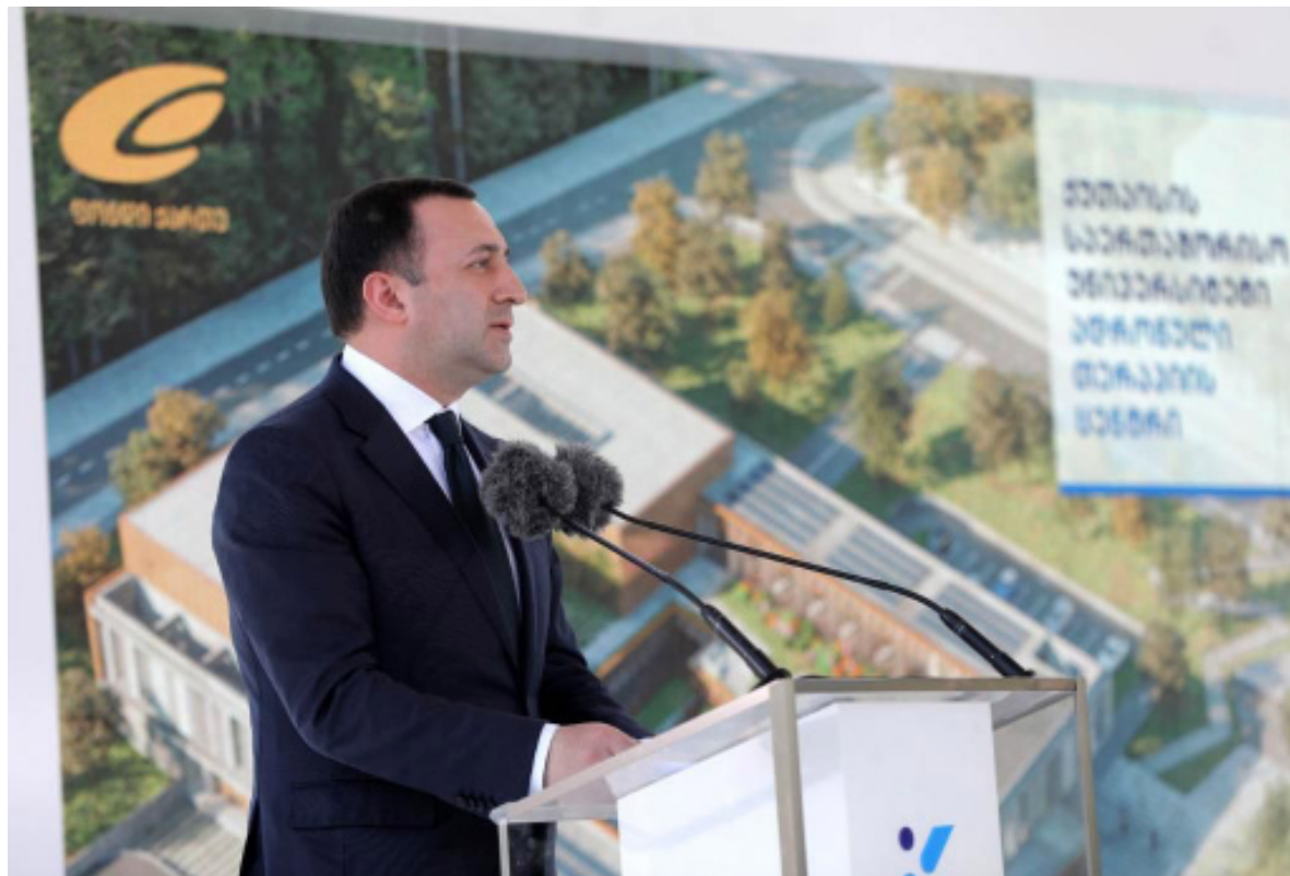
The €1 billion project is entirely financed by the Cartu Foundation in cooperation with Ion Beam Applications, a leading international proton therapy company.