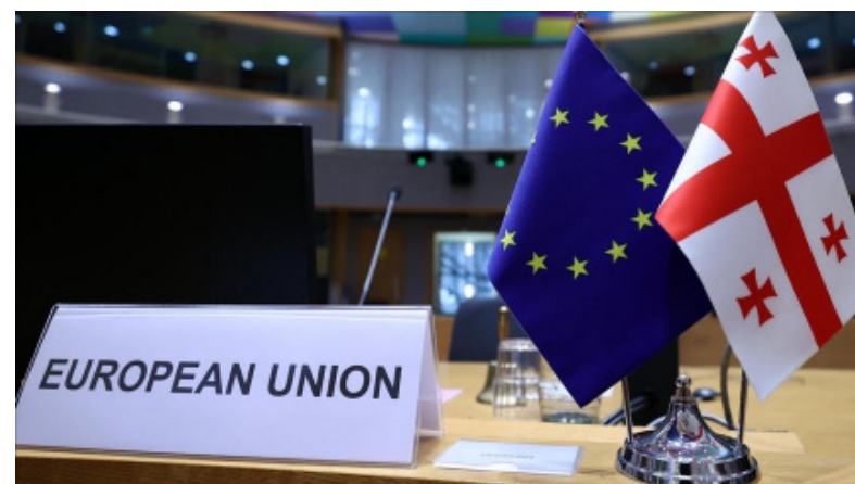
European Council decided on June 23 to grant EU candidate status to Georgia once the priorities outlined in the 12-point recommendations are addressed.

For the record, European Council decided on June 23 to grant EU candidate status to Georgia once the priorities outlined in the 12-point recommendations are addressed. A Parliamentary working group has already been created that will review judicial reforms, which is one of the preconditions outlined by the European Union for granting Georgia the membership candidate status.