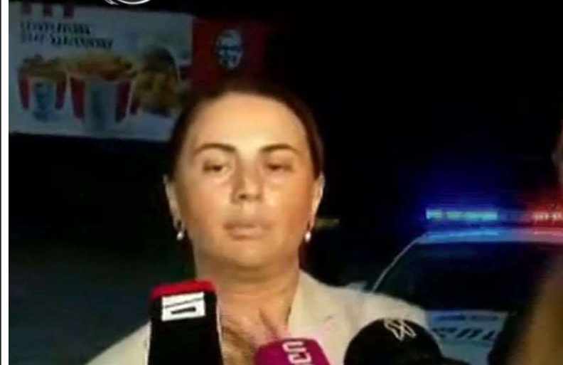
The Director of the Strategic Communications Department of

"The special operation has ended, all the hostages are free, and one person has been arrested."