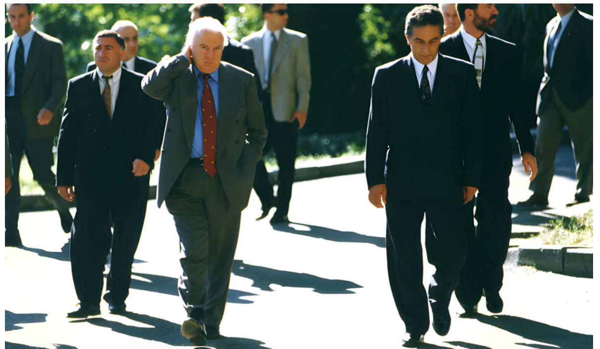
Eduard Shevardnadze and Vladislav Ardzinba

The so-called foreign affairs minister of occupied Abkhazia said on September 16 that "taking into account the current international conditions, the probability of war with Georgia is quite high". According to Ardzinba, Georgia is in consultations with NATO, increases contracts for the purchase of weapons and unmanned aerial vehicles, and has activated its intelligence.