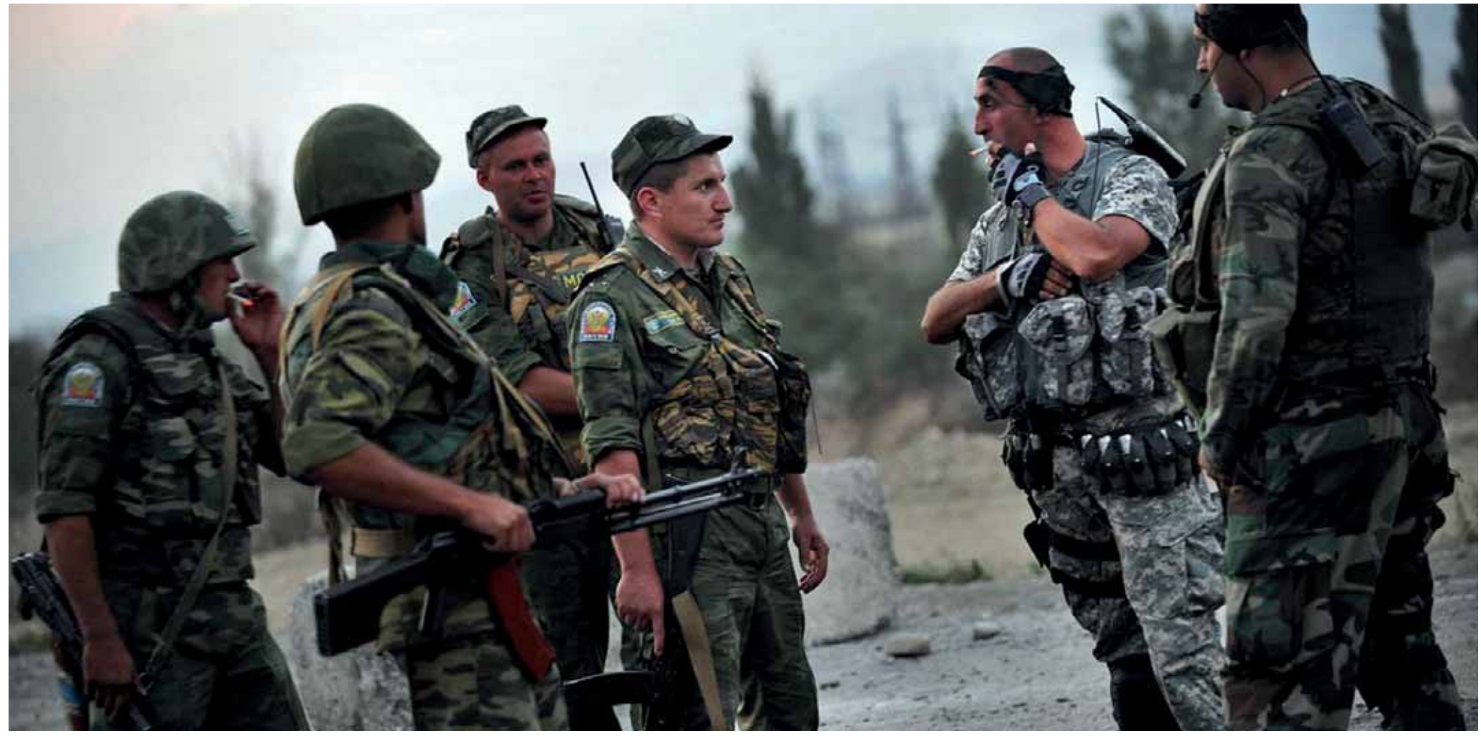
Russian and Georgian soldiers talk prior to the Russo-Georgian war in 2008.