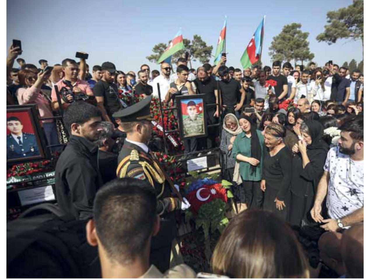
Funerals of Azerbaijani servicemen this September.

Armenia's Prime Minister Nikol Pashinyan stated that up to 50 Armenian servicemen had died so far, and the figure was likely to rise further. The country has officially approached the Collective Security Treaty Organization (CSTO), the Russia-led military grouping, for help. Parallel to this, a