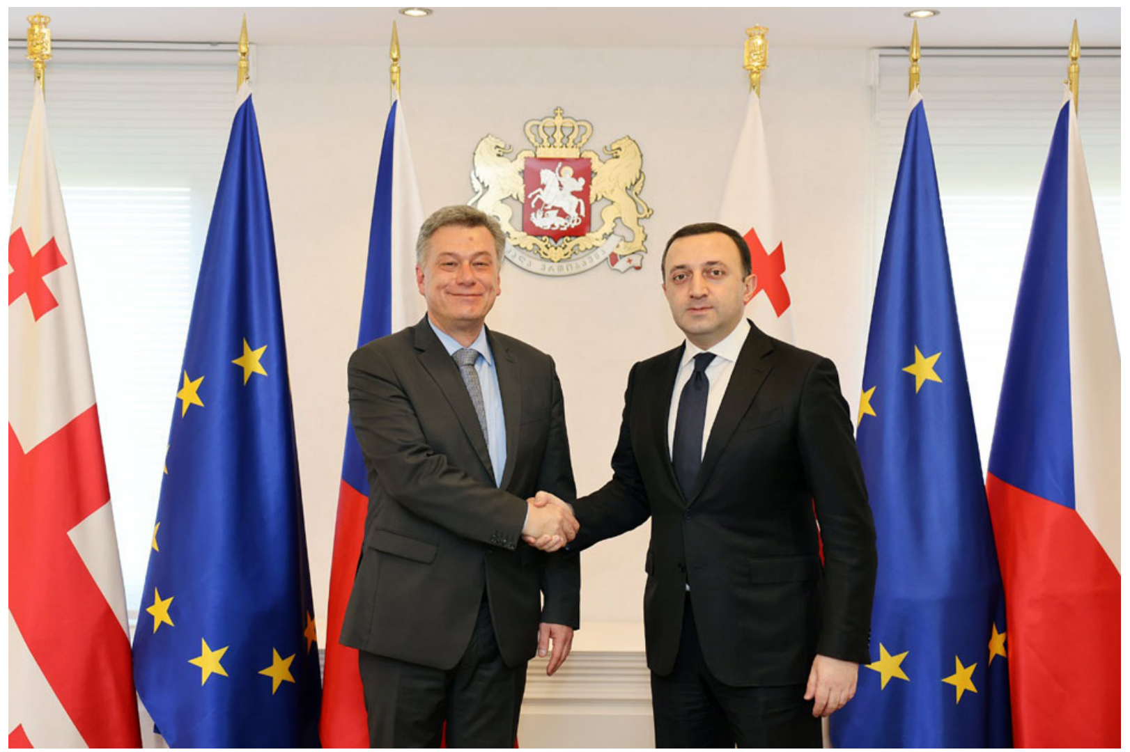
By Liza Mchedlidze

The Prime Minister of Georgia Irakli Gharibashvili met with the Minister of Justice of the Czech Republic Pavel Blazek.