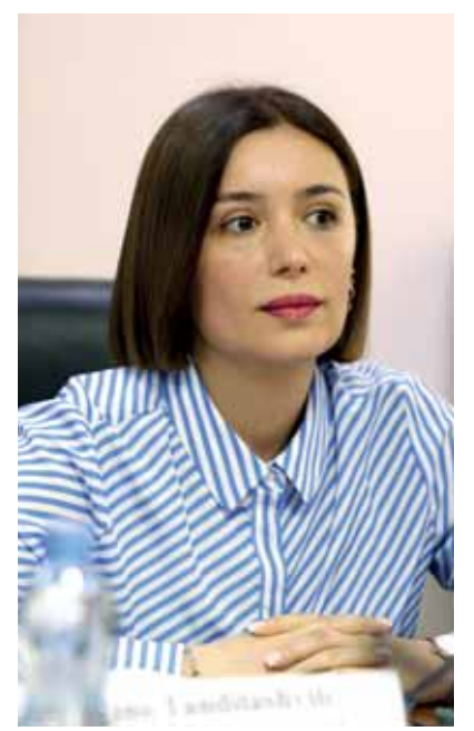
Nino Thandilashvili, Deputy Minister of Environmental Protection and Agriculture

Therefore, she adds, it is "high time" that the government engaged the private sector to mobilize green investment, promote green private sector develop-