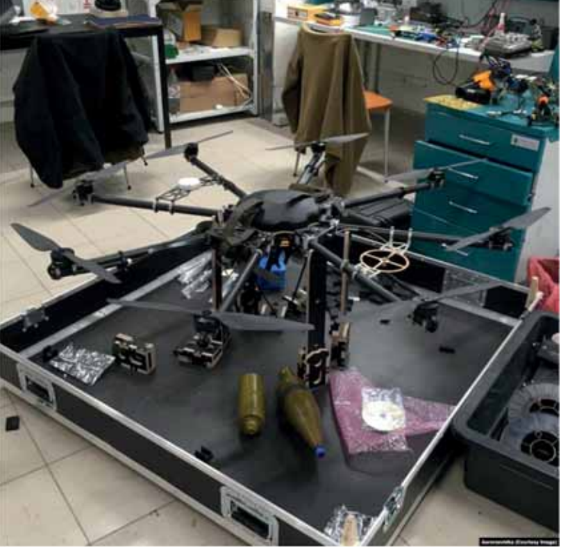
The commercially popular DJI drones, An R18 drone with munitions.

Witnessing this latest development in battlefield technology and the way warfighters, commanders, and engineers handle the change is continuously fascinating. As each side in Ukraine attempts to outdo the other, Georgia, NATO, and others furiously take notes. What comes of this new wave, and what it births next, will be the watchword for defense analysts, industry experts, investors, and governments for decades.