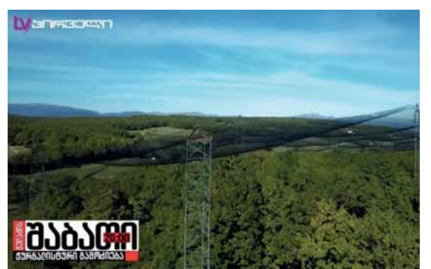
The footage shows that the forest area has already been partially covered.

he Georgian National Forestry Agency has leased 125,000 square meters of forested land to a company allegedly owned by the billionaire founder of Georgia's ruling party, Bidzina Ivanishvili.