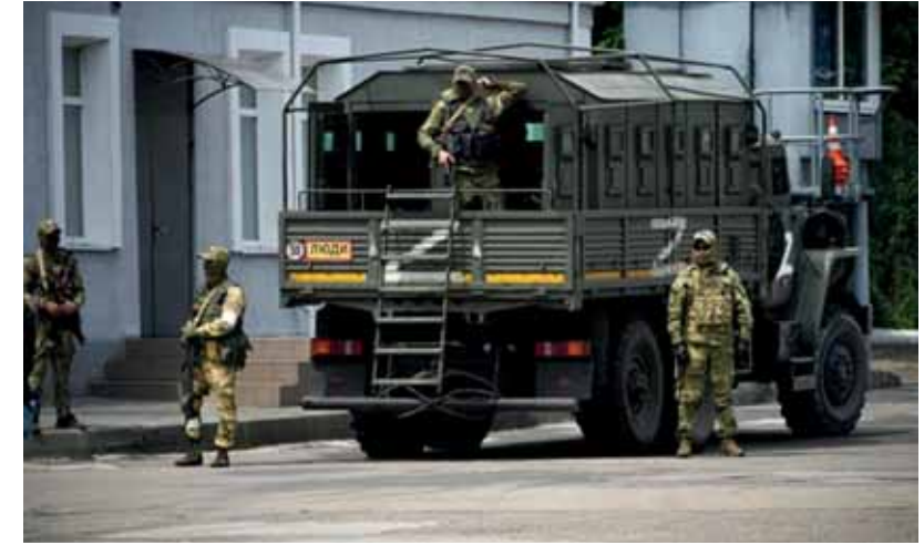
Russian troops in Kherson city.

PM Garibashvili Participates in the Roundtable Discussions Investing in the Future of Energy at the 27th UN Climate Change Conference