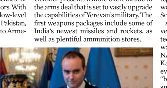
Armenian Defense Minister Suren Papikyan and Minister of the Armed Forces of France Sébastien Lecornu in Paris.

All three have stopped short of providing military assistance to Yerevan, some-