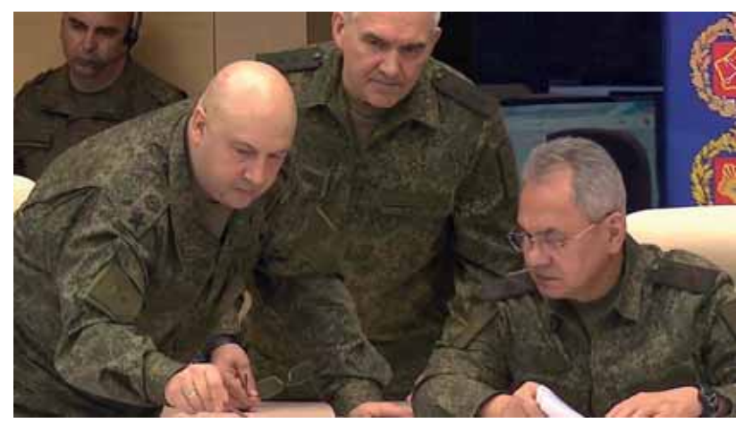
General Sergey Surovikin (left) and Russian Minister of Defense Sergei Shoigu (right).