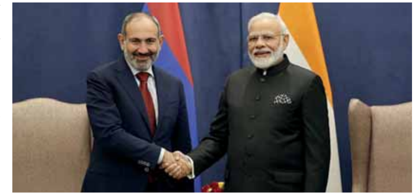
Prime Minister Nikol Pashinyan meets with India's Prime Minister Narendra Modi.

As daily skirmishes continue along the new border, including a multi-day conflict thing the country's leadership has been that left more than 200 people dead, Yere- more vocal about. However, Armenia has Following a purchase of over $245 mil- lion of armaments, the two defense minvan has a need for might. Russia has largely left the country to its own devices. Despite a massive arms deal that fell through due to Moscow's dire need for supplies in Ukraine, Armenia has gone shopping with anyone who will open its proverbial doors. While many have avoided this call so as to not anger oil-rich Baku, some have seen this as an opportunity to cash in on this seemingly never-ending war. Armenia has recently reached out to some surprising new friends. The European Union, the Organization for Security and Co-operation in Europe (OSCE), and the United States have all received attention from Yerevan as it seeks a variety of solutions. The EU and its OSCE have both sent missions to the region with the goal of meeting with relevant officials and observing the border area. However, Baku has raised issues with this, noting that they were never included in consultations with European officials prior to their deployment, thus making them biased towards Armenia.