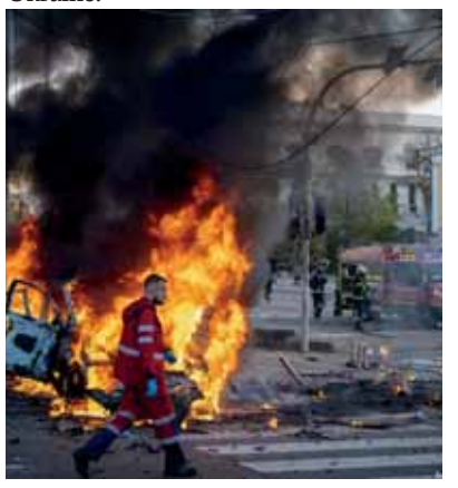
A medical worker passes a burning car after a Russian attack in Kyiv, Ukraine.

Ultimately, the answer to the aforementioned question is a resounding 'no'. Russian command cannot hope to win this war by attempting to bomb the population into forcing Kyiv to capitulate. Ukraine has already firmly made its position clear that defeat is not an option. With more major defeats than significant victories, the Kremlin is running short on its own options. As the popular online saying goes, "the Russian army was thought to be the second best in the world. It turns out it's only the second best army in Ukraine."