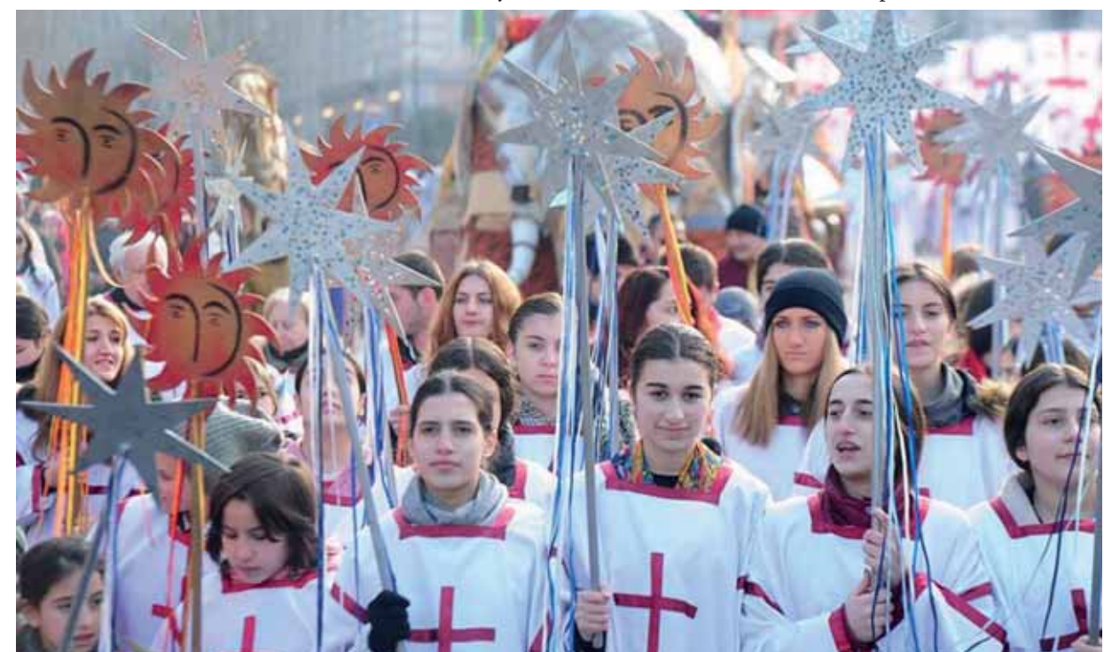
as the freshly fallen snow. His cape, Children dressed in traditional clothing taking part in an Alilo procession in Tbilisi.

For outsiders, Georgia offers a new holiday experience with connections to familiarity. With a mixture of Western and traditional Georgian motifs, the country still has a warm and inviting feeling in spite of the cold Caucasian winter. This holiday season, decorate your own chichilaki tree, enjoy churchkhela from Tovlis Papa, and settle in with the soft tones sung by children on their Alilo procession.