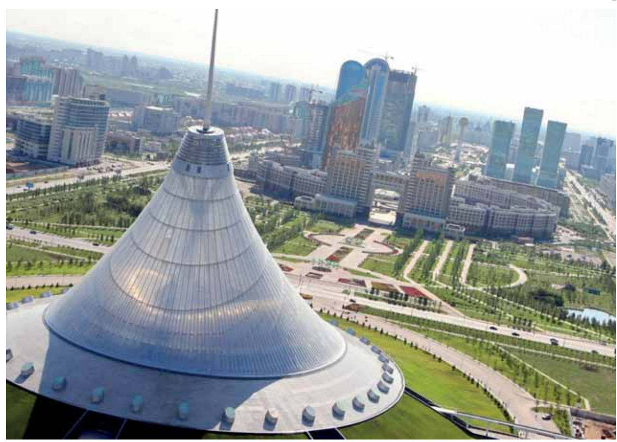
Astana, Kazakhstan.