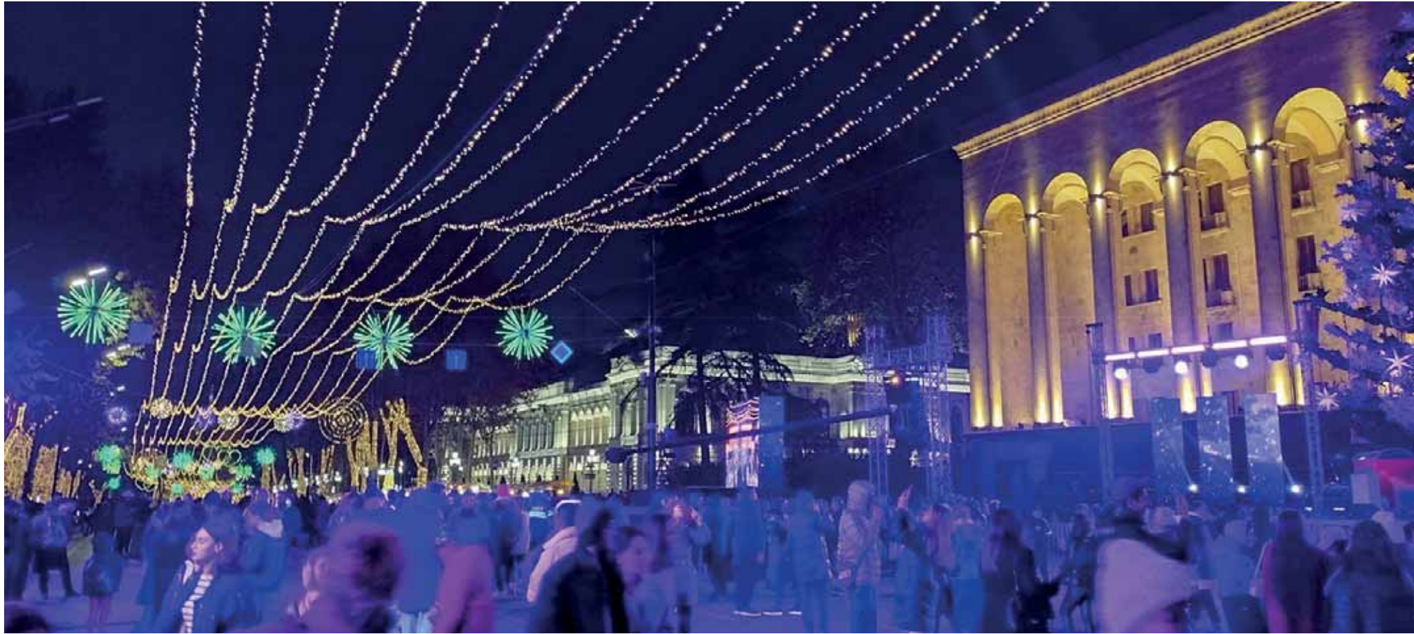
Christmas lights in downtown Tbilisi.