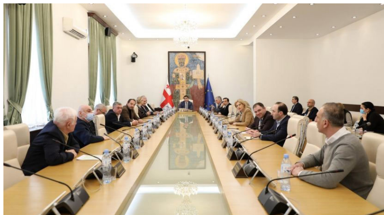
At the meeting of the Bureau of the Parliament, the second version of the 'Agents of foreign

influence' law was registered and submitted to the leading committees for consideration.