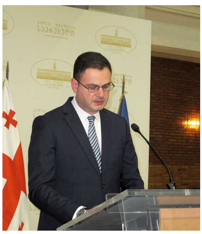
Deputy Minister of Foreign Affairs of Georgia Mr. Teimuraz Janjalia