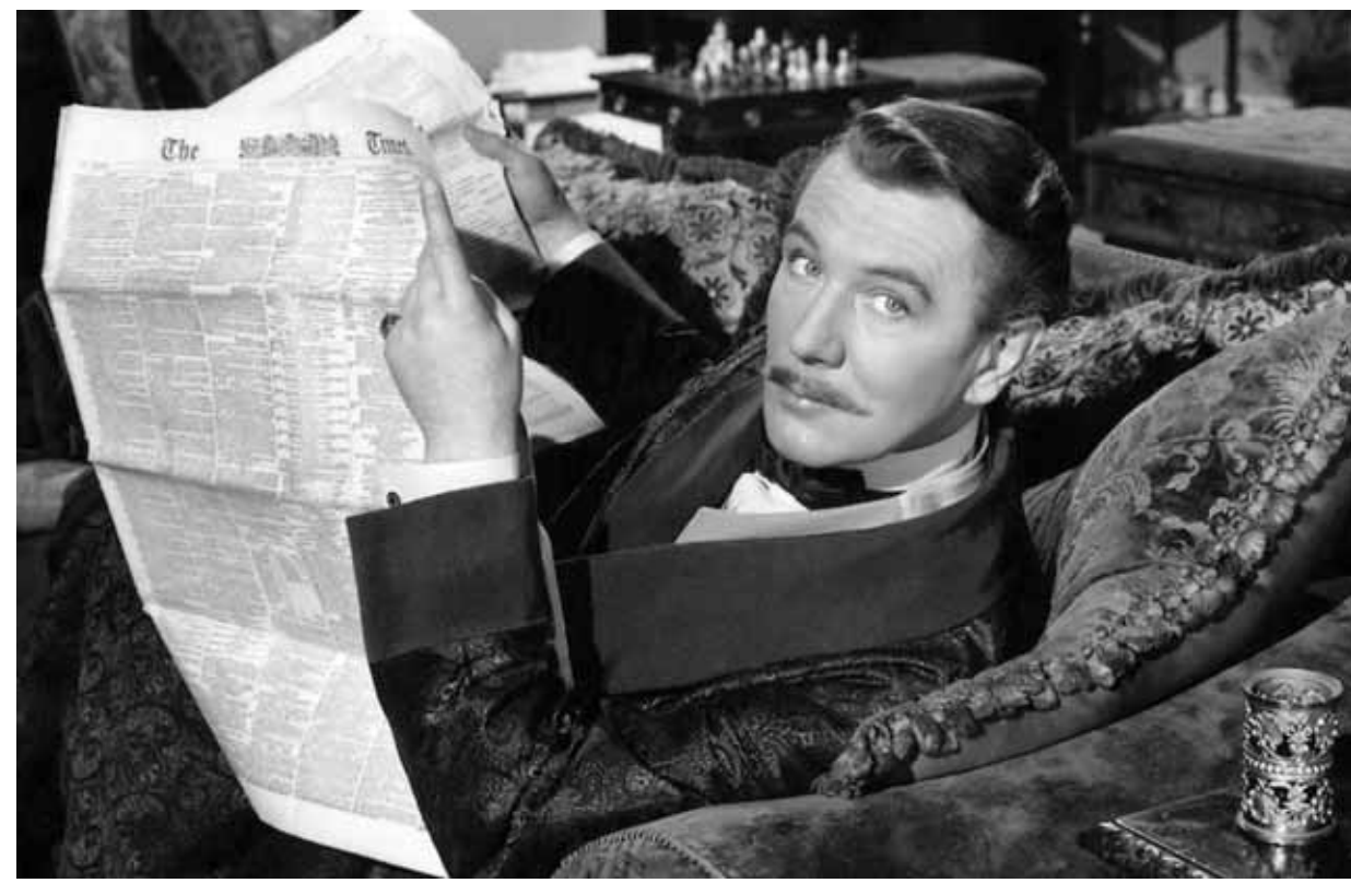
The Importance of Being Earnest. 1952 adaptation.