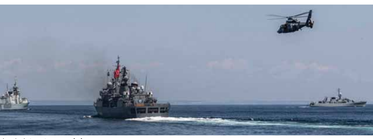
The Black Sea.

A broad discussion of future competition is emerging as countries, parliaments, presidents, and corporations respond to events in Ukraine. Francis Fukuyama posited in "The End of History and the Last Man" that competition was limited, as the universalization of Western liberal democracy had ascended