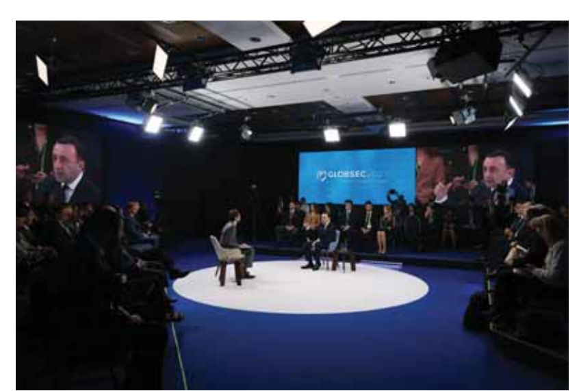
Georgia's Prime Minister answering questions during GLOBSEC 2023 in Bratislava, Slovakia.