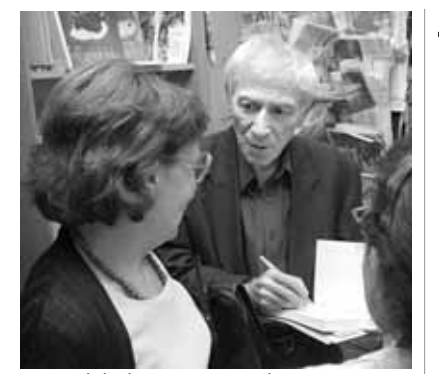
Otar Chiladze.