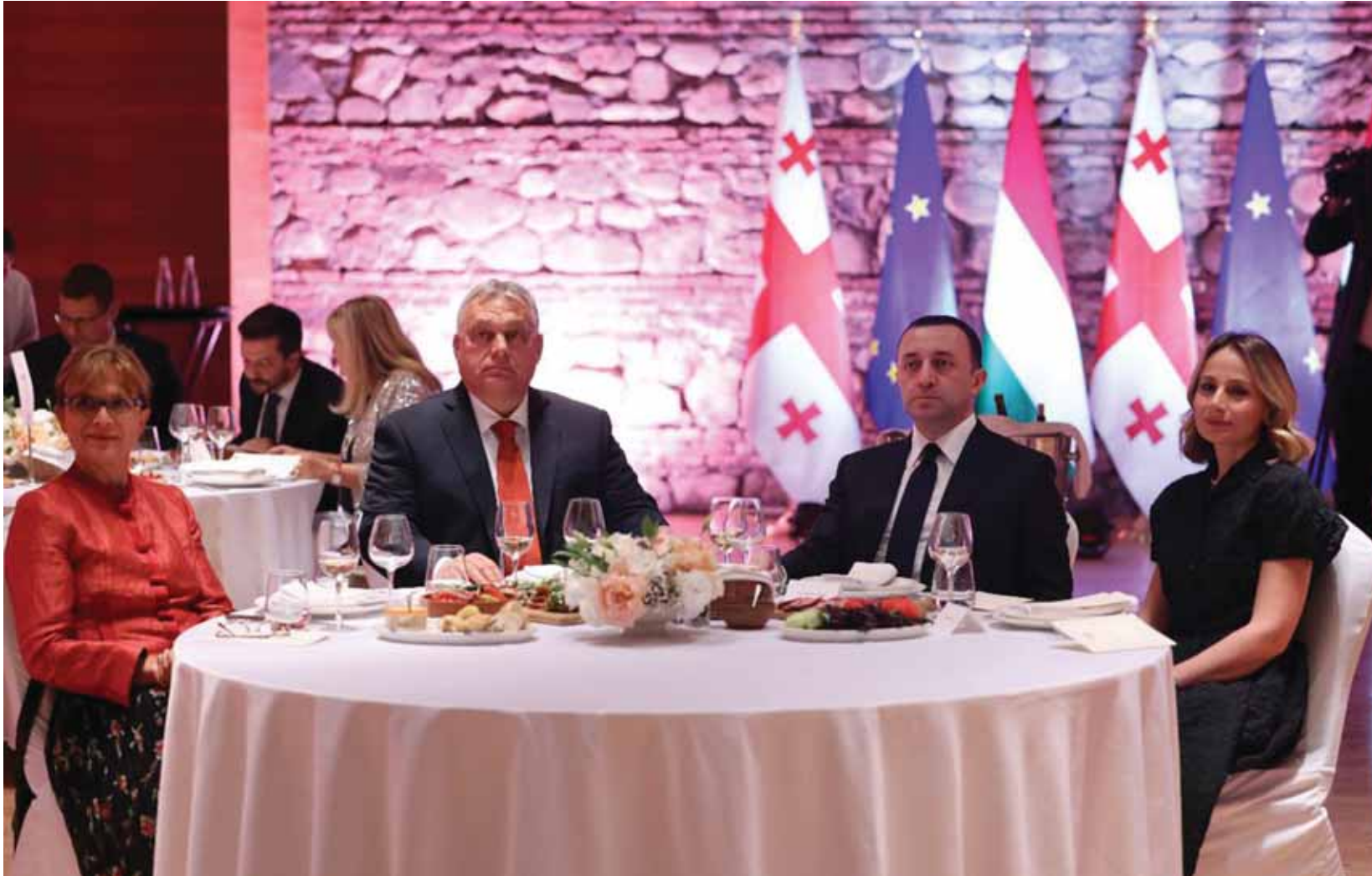
Hungarian Prime Minister Viktor Orbán came to Georgia with his wife, Aniko Leva.