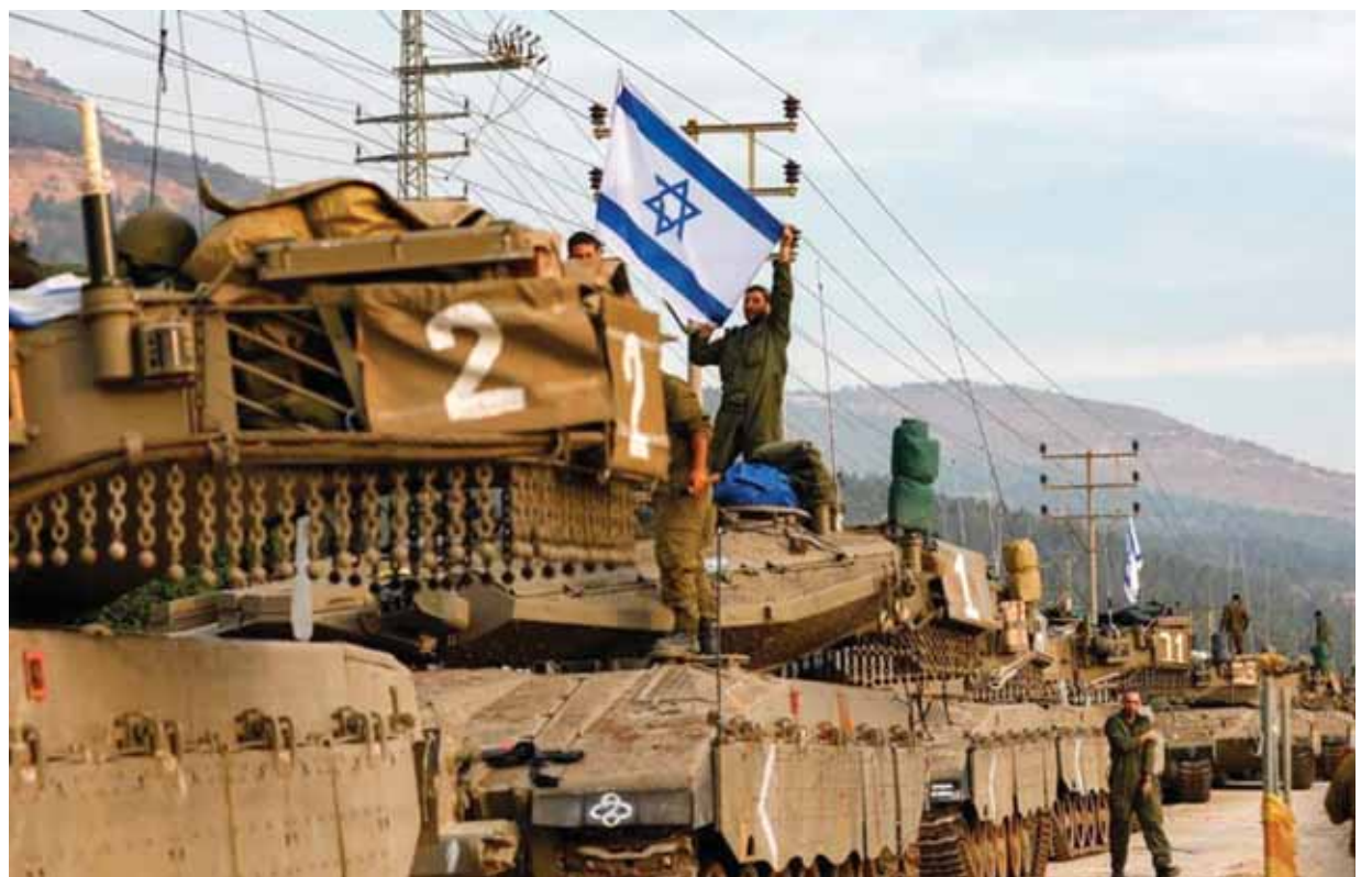
The ongoing conflict in Israel.

It's not about suffering. That's the Russian perspective. But I think the capabilities of democracies are far higher than the capabilities of Russia. The question is, what does it need for us to unlock the capabilities we have? How bad does it have to get? I think there's the false idea in the heads of policymakers that somehow if you support a little bit, it will lead to a stalemate, and then there will be negotiations. This is a totally misread judgment on Putin's intentions, because he will immediately make further demands. I have no doubt the democratic countries will prevail in this, but I would argue that they should unlock the capabilities much faster and not wait for wonders to happen. Our dragging out feet ends up with dead Ukrainians and Ukraine being devastated as a country. If you look at the material side of this - Germany spent 300 billion euro on social output to dampen the effect of the energy prices - 300 billion euro! And weapons for Ukraine so far is 3 billion euro, so I mean, if we unlock our capabilities, then we could do much more and help more decisively.