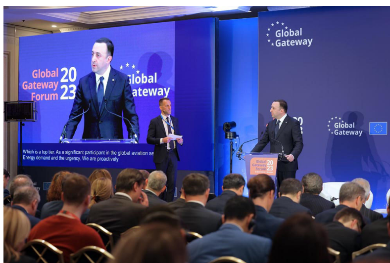
Prime Minister of Georgia Irakli Gharibashvili underscored the significance of

Georgia's participation in the Global Gateway Forum in Brussels during his speech, highlighting the country's recent progress and major projects.