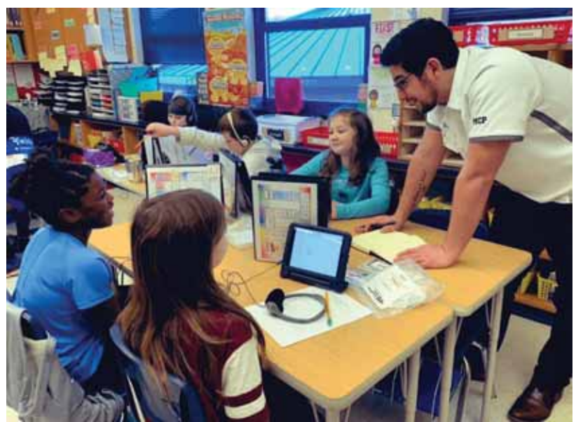
Modernizing teaching.

Generally speaking, education has a proclivity to lag behind real life, especially when the industrial progress is revolutionary and the means of acquiring relevant knowledge is obsolete. The solution here might be free access to