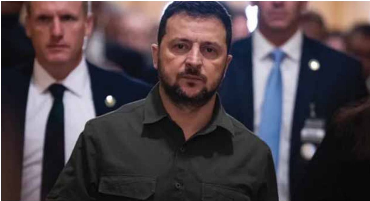
Ukrainian President Zelensky in the US in September.