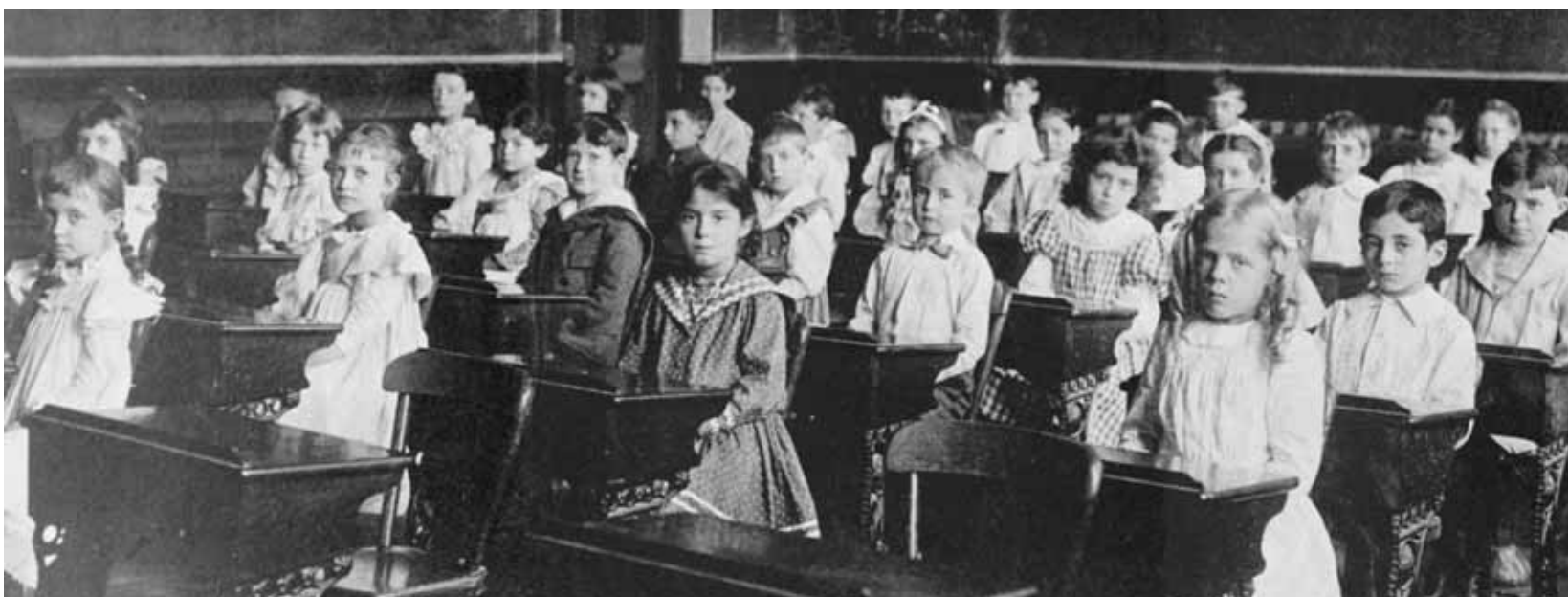
School in the 1800s.

The relevant modern education is another valuable product of our time, one which needs to be made flexible enough for our youth to easily imbibe all the new technological advancements, not letting the system be weakened or even paralyzed by outdated educational content and means of its proliferation. We cannot afford any longer to accept the system as it is. It has to be better!