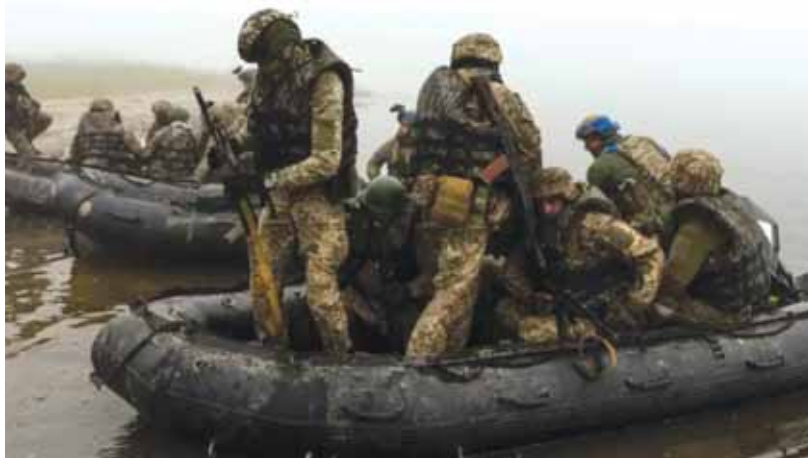
A group of Ukrainian marines push off from the bank of the Dnieper River at the frontline near Kherson, Ukraine.

“Additional forces have now been brought in,” he said, claiming that Ukrainian forces were blocked in the village of Krynyki, where “a fiery hell” awaited them. “Bombs, missiles, ammunition from heavy flame-thrower systems, artillery shells, and drones are flying at them [Ukrainian forces] ... Over the last two or three days alone, the enemy’s total losses amounted to about a hundred militants.”