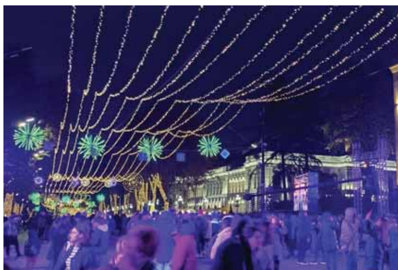
Light-up day on Rustaveli Avenue.