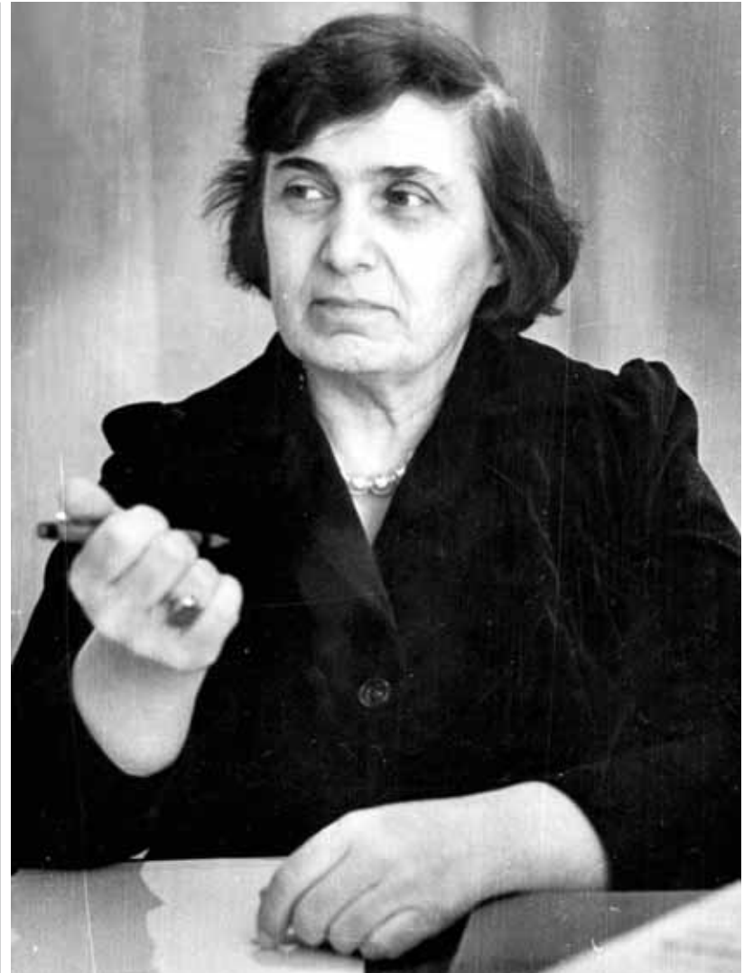
Ana Kalandadze.

All-in-all, the holidays in Georgia are a month-long celebration involving lots of wine, lots of food, plenty of chance to shop and hear Christmas music, and as much fun with friends and family as you can take! Enjoy!