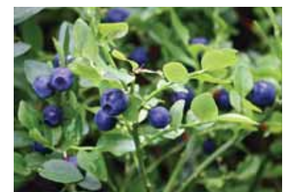
Bilberry.

In 2006, she received the "Saba" literary prize for her special contribution to literature. Ana Kalandadze died in March 2008, from a stroke. She is buried in Mtatsminda Pantheon.