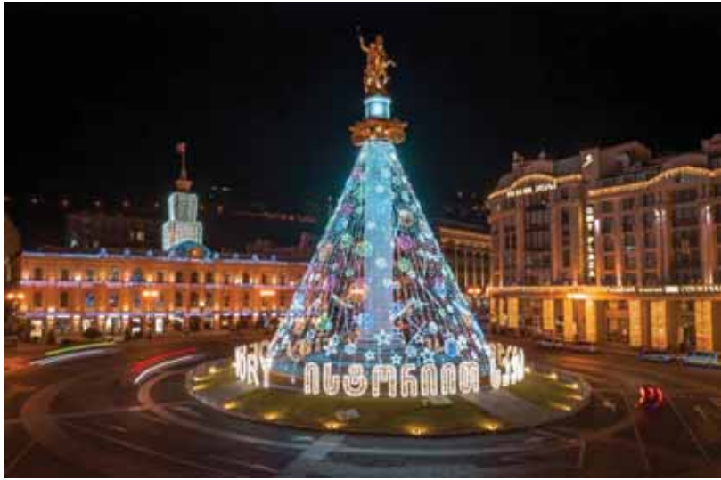
The Liberty Square "Christmas Tree" 2022.