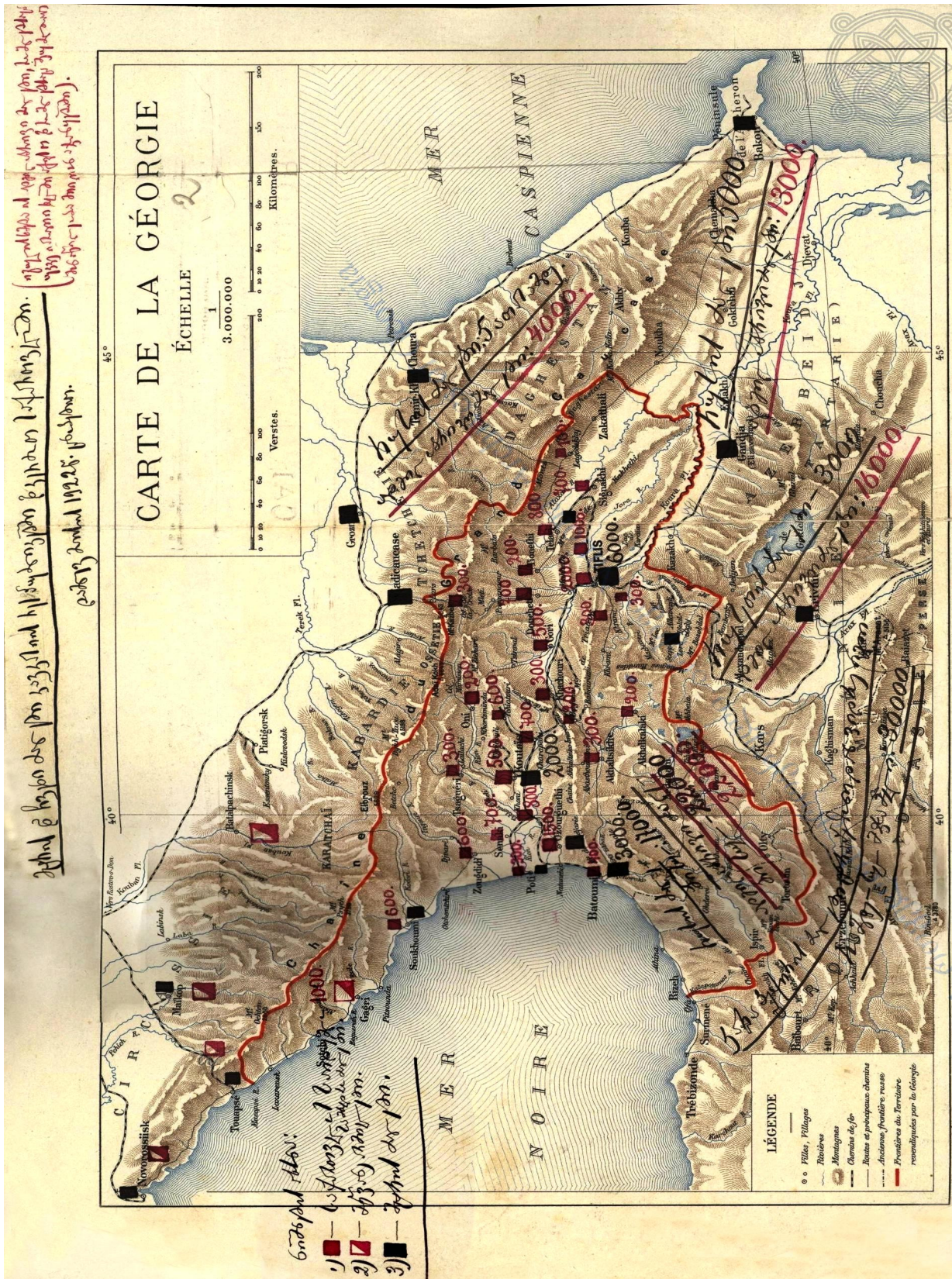
рука # 3

1922- 1924 წლის იანვარში დასრულებულია გეგმა დასრულებულია 1924 წლის იანვარში. გეგმა დასრულებულია 1924 წლის იანვარში. გეგმა დასრულებულია 1924 წლის იანვარში. გეგმა დასრულებულია 1924 წლის იანვარში.