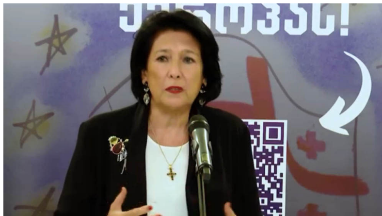
In the Orbeliani Palace, the President of Georgia, Salome Zourabichvili, hosted representa-

tives from the medical field who joined the ‘Our Voice for Europe’ signature campaign. According to Salome Zourabichvili, the medical field is a part of society that is well aware of how much Georgia needs Europe.