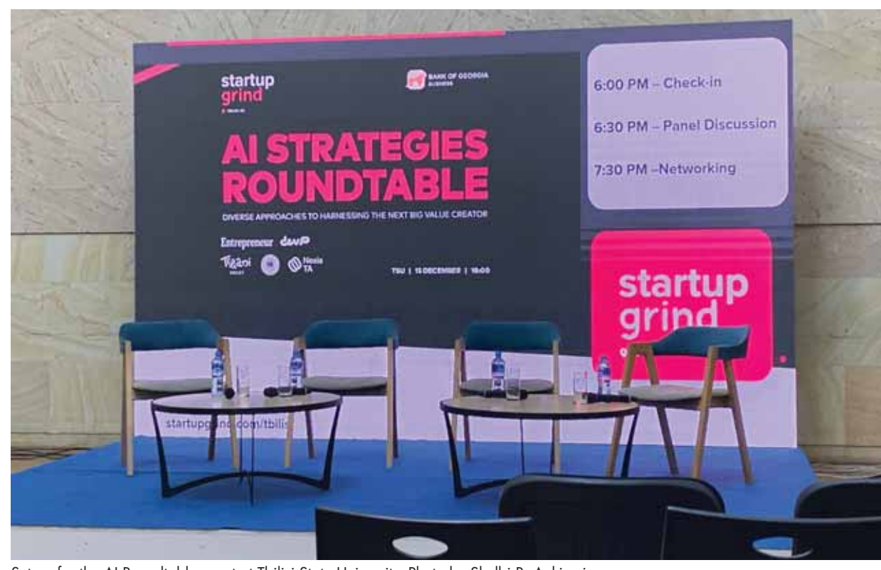
Set up for the AI Roundtable event at Tbilisi State University.

The biggest AI service Kernel uses is voice navigation, which allows a customer to directly talk to the application