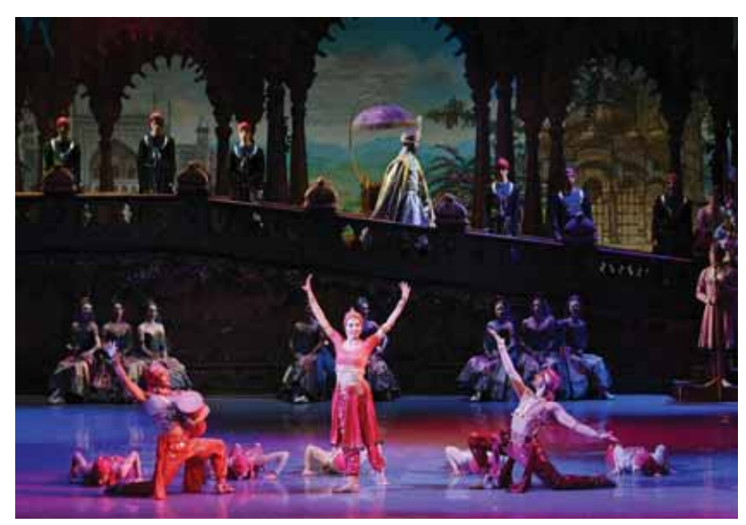
Lado Vachnadze in Bayadera