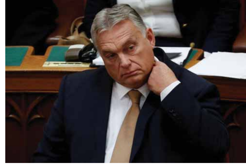
Continued on page 4 Hungarian Prime Minister Viktor Orban.

At the moment, what we see is that it's in his interest to create a group of illiberal states and increase the number of illiberal states within the