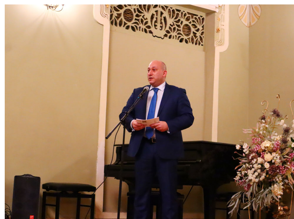
Deputy Minister of Foreign Affairs of Georgia Mr. Alexander Khvtisiashvili