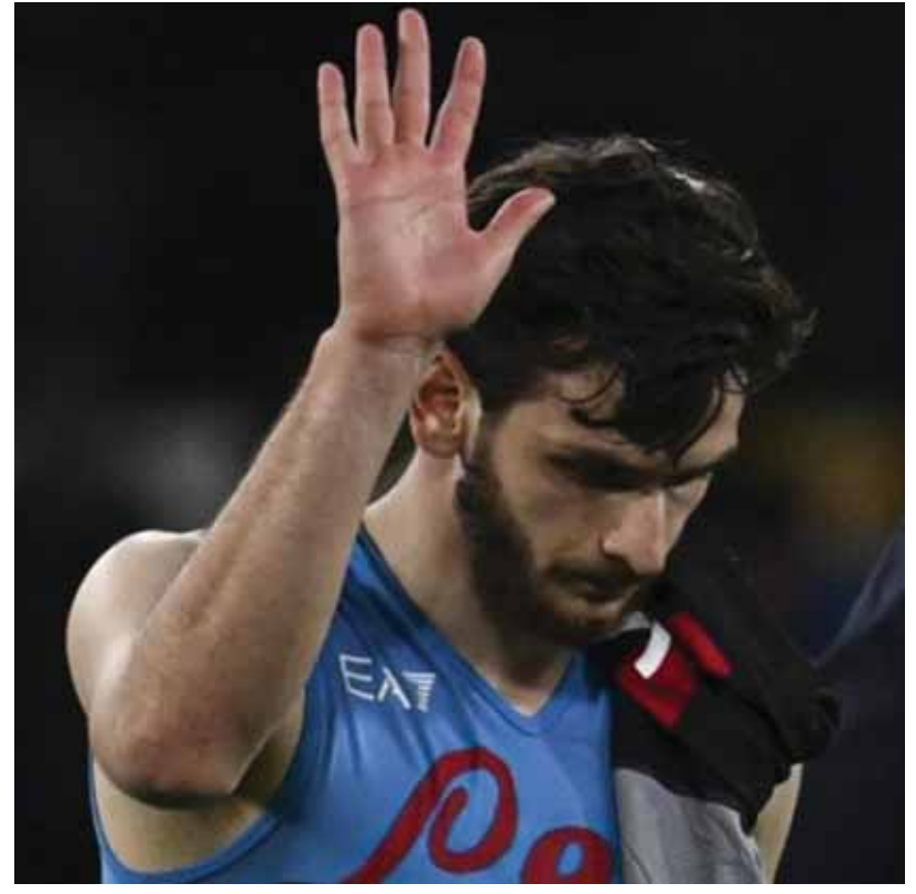
Khvicha Kvaratskhelia.