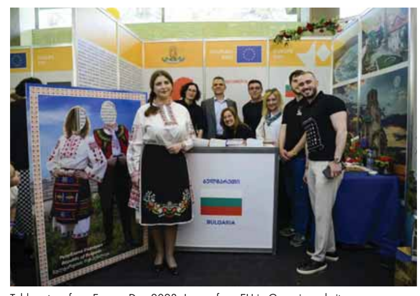
Table set up from Europe Day 2023.

in the streets, young people mainly, spontaneously saying they see their future in the EU," Cendrowicz tells GEORGIA TODAY. "Europe Day will not be about those protests, but we're hoping that those who say very clearly that 'Our future is in the EU,' can come and celebrate that with us."