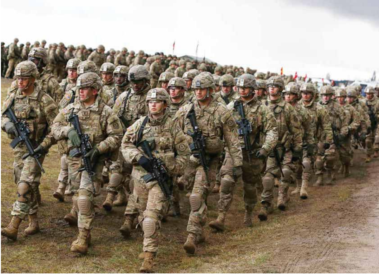
US soldiers attend welcoming ceremony for US-led NATO troops near Orzysz, Poland.

"No hits to residential or critical infra-