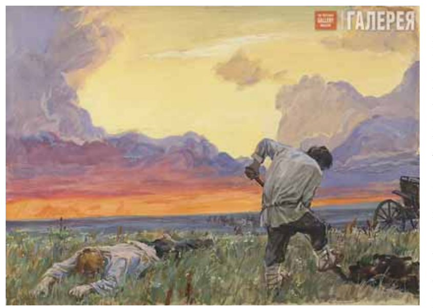
Illustration to "How Much Land Does a Man Need?" by Leo Tolstoy. 'Pahom's Death'. Painting by Plastov Arkady, 1952. Watercolour on paper. 64 × 87 cm

Taking all of the above into account, in the context of effective structuring of Georgia's economic security, we will present together some previous opinions. It is clear that each of them needs further elaboration in professional circles. In