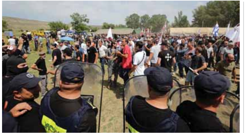
Organizers canceled the event after anti-LGBTQ activists disrupted the Tbilisi Pride festival on July 8, 2023.

aid for Ukraine and said Washington was rushing ammunition, armored vehicles, missiles and air defenses to the country to ensure their speedy delivery to the front line.