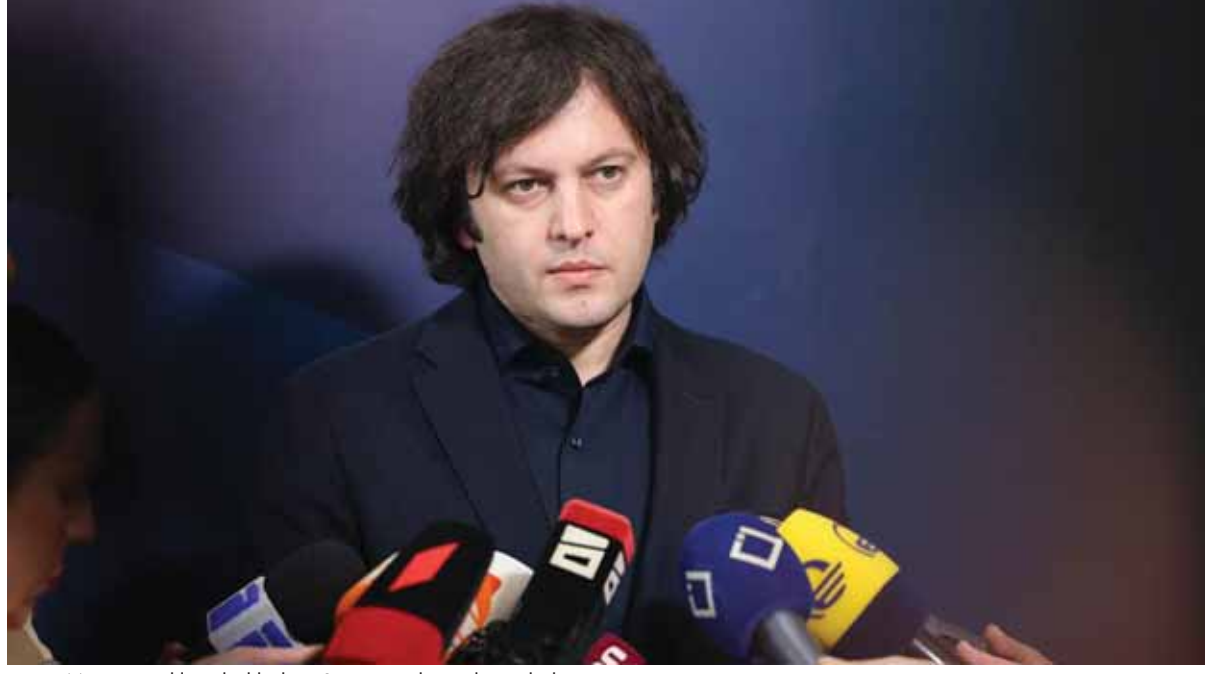
Prime Minister Irakli Kobakhidze