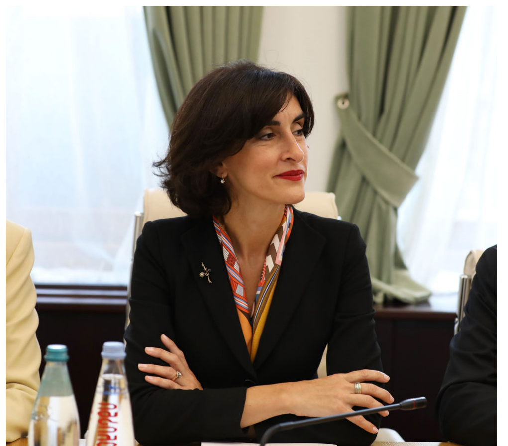
Georgia's relations with its partners following a meeting with Uzra Zeya, Deputy Secretary of State of the United States of America.

what we want to do. That is, let's continue to support Georgia in all fields," said Ambassador Gasri, emphasizing the need for the Georgian government to change its current trajectory to resume full co-