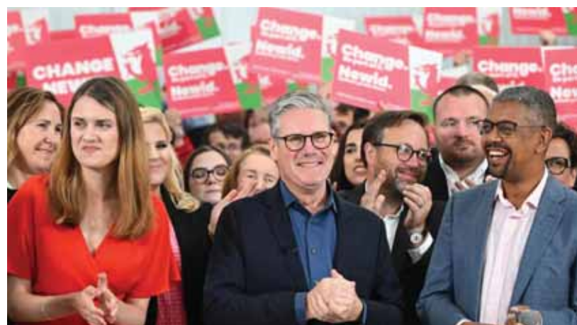
Labour Leader Sir Keir Starmer.

I think it damaged her. But the very thing that people are saying- that her getting third place instead of first place is a defeat, is already a testament to her success, because that would have been unthinkable a couple of years ago.