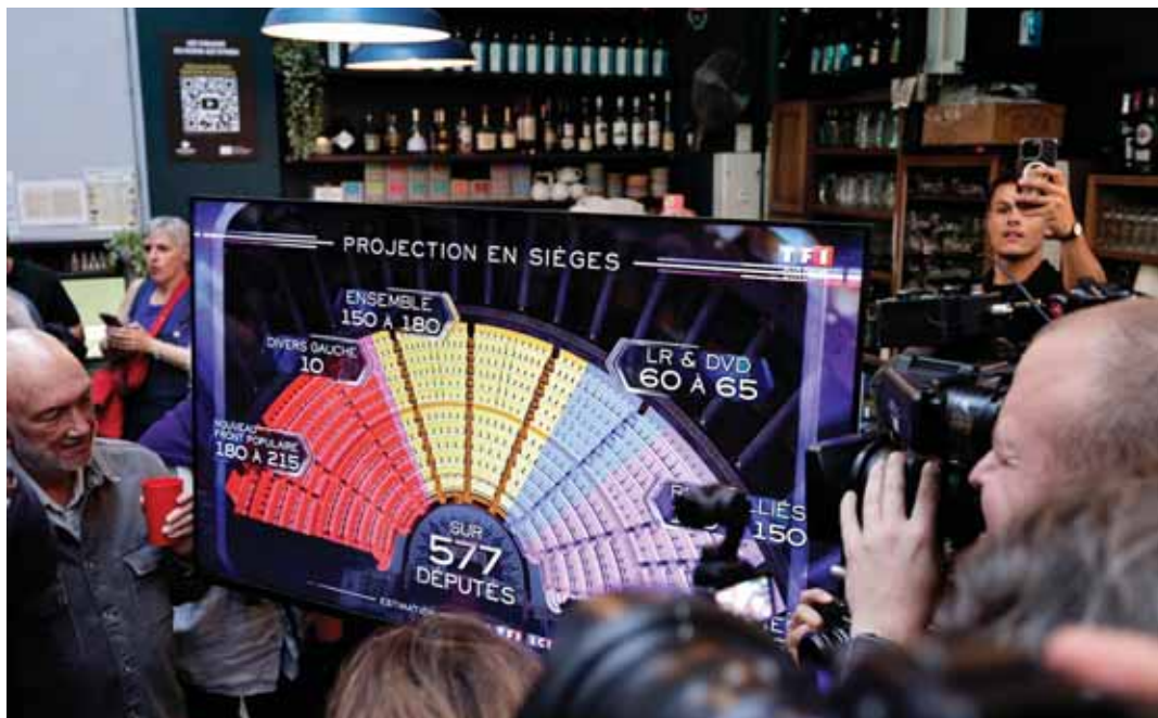
Election night event in Paris on July 7, 2024.