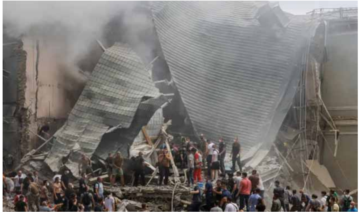
Rescuers work at Ohmatdyt Children's Hospital that was damaged during a Russian missile strikes on Kyiv, Ukraine July 8, 2024.

Ukraine is on an "irreversible" path to NATO membership, US Secretary of State Antony Blinken said Wednesday, advancing American assurances that the country will be allowed to join the Western military alliance, but only after its