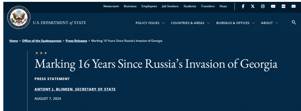
Today we mark sixteen years since Russia invaded the sovereign nation of Georgia and remember those killed, injured, or displaced by Russia's military campaign and illegal occupation. To this day, Russia continues to occupy 20 percent of Georgia's territory and impose its will on the people there, including by claiming the transfer of strategically important lands in Abkhazia to Russia and taking steps to establish a permanent naval base in Ochamchire.

European Court of Human Rights' decisions against Russia. GYLA also criticized the government for opposing civil society efforts, stating, "Instead, the Georgian authorities are openly fighting against civil society, which plays an important role in protecting the rights of people affected by the conflict at the international and national level, with the 'Russian law'."