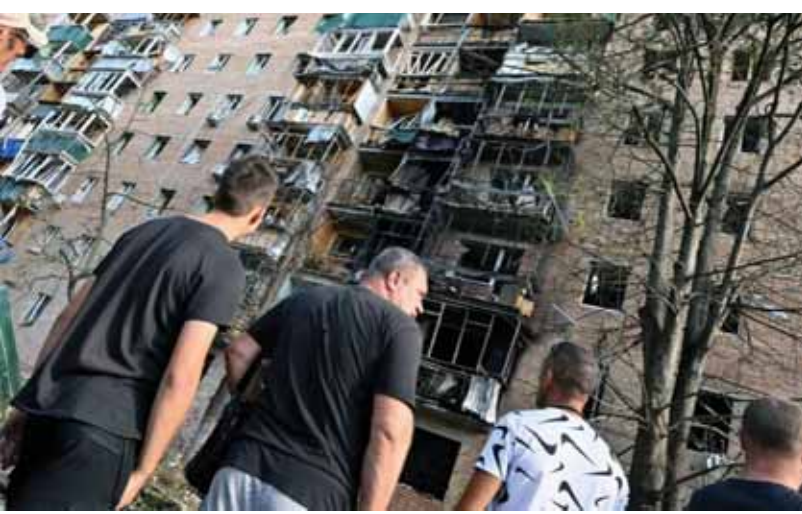
A multistory residential building in Kursk, Russia, was hit, according to local authorities, by debris from a destroyed Ukrainian missile in the course of the Russia-Ukraine conflict.

units have driven deep into the country, saying on Sunday they had reached as far as 30km from the border.