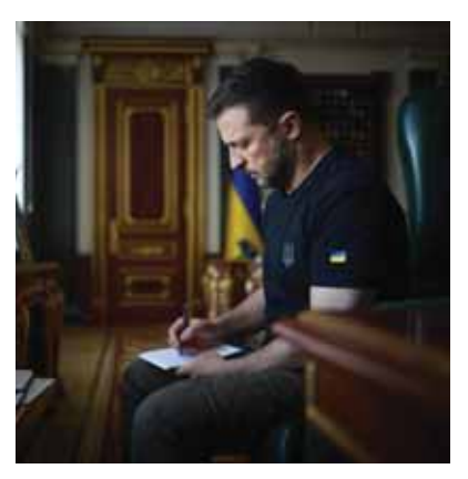
President Zelensky.