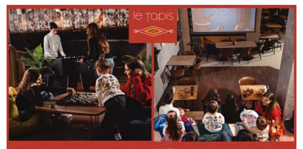
great place for friends & family gatherings

Our anti-radar systems worked wonders, with the help of the Western equipment I might say, to basically make it impossible for the Russian drones to fly. And you can see the extent of our success in Russia already: You can see the absolute hysteria among the Russian military experts and bloggers. You can see the fear on Putin's face, on Russian TV. Can you imagine that? Could you have imagined that? Putin's face, where he seems to be in absolute turmoil and about to lose it, on Russian TV, as the Kursk governor is briefing him that aged to completely dupe them and circumvent Ukrainian forces are rapidly expanding into Russian territory. That was vivid.