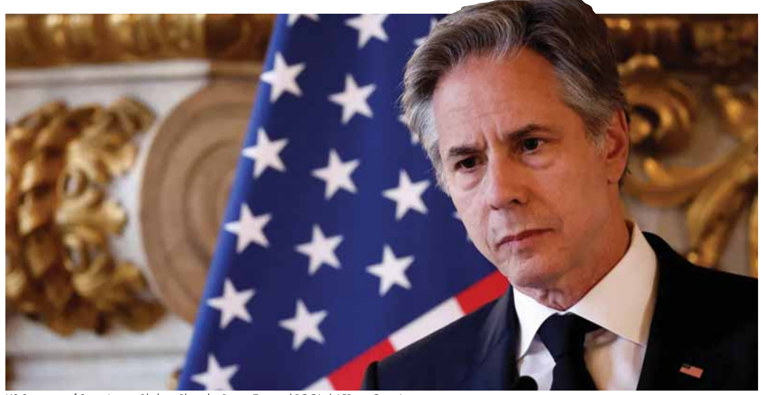
US Secretary of State Antony Blinken.