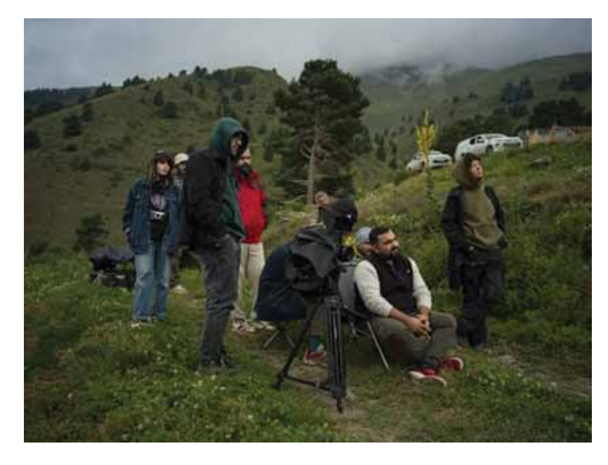
BY ANA DUMBADZE

onsidering the importance of preserving and protecting natural resources, the role and contribution of organizations that work tirelessly in this direction becomes even more valuable. One such organization operating locally, known for its dedicated work promoting conservation of wildlife in Georgia and encouraging the sustainable use of natural resources, is SABUKO, the Society for Nature Conservation and Birdlife Partner in Georgia.