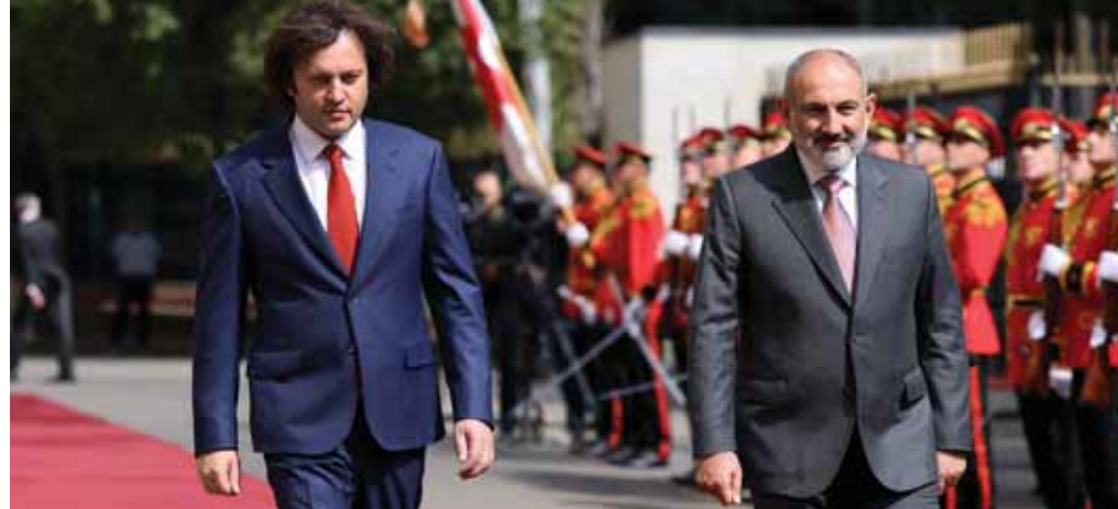
Prime ministers Kobakhidze and Pashinyan