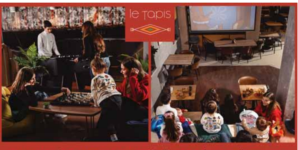
great place for friends & family gatherings

"Dear Prime Minister, I sincerely believe that we have a historic opportunity to resolve conflicts in the South Caucasus and establish sustainable peace in our region. I am also convinced that Armenia and Azerbaijan are not the sole beneficiaries of this peace. Georgia and Turkey stand to gain as well. In light of these challenges, our government will persist in its efforts to maintain peace in the region. We commend the Georgian government's contributions to fostering regional and international stability and peace," he concluded.