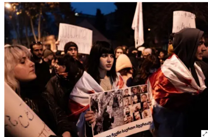
Thousands gather outside of Georgia's parliament in the capital, Tbilisi, to protest the ruling party's suspension of European Union accession talks, December 11, 2024.

Effective Investigations, Accountability Urgently Needed