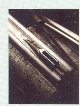
Rifle sights in detail

Skill, fieldcraft and patience are all required of the hunter. He, in turn, can rely on the Holland & Holland "Royal" double rifle, which has been tailored precisely to his needs. It will take shape week by week as it is built to the customer's order – the stock of finest walnut, painstakingly oil finished; the barrels carefully regulated for maximum accuracy; and in all calibres the classic lines of his rifle enhanced by Holland & Holland's master engravers. Together these features combine to ensure that each "Royal" is a unique creation and, undoubtedly, one of the world's finest rifles.